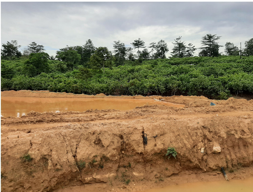
Figure 2. Mining adjacent to cocoa farm in Asankranbreman, Ghana, April 2022.

The environmental degradation in these overflow situations should not be underemphasized (See Figures 2 and 3 supplemental files). As discussed, the flooding referenced here and in all such cases is chemical laden water used in the extraction process, which poisons vegetation and water sources.