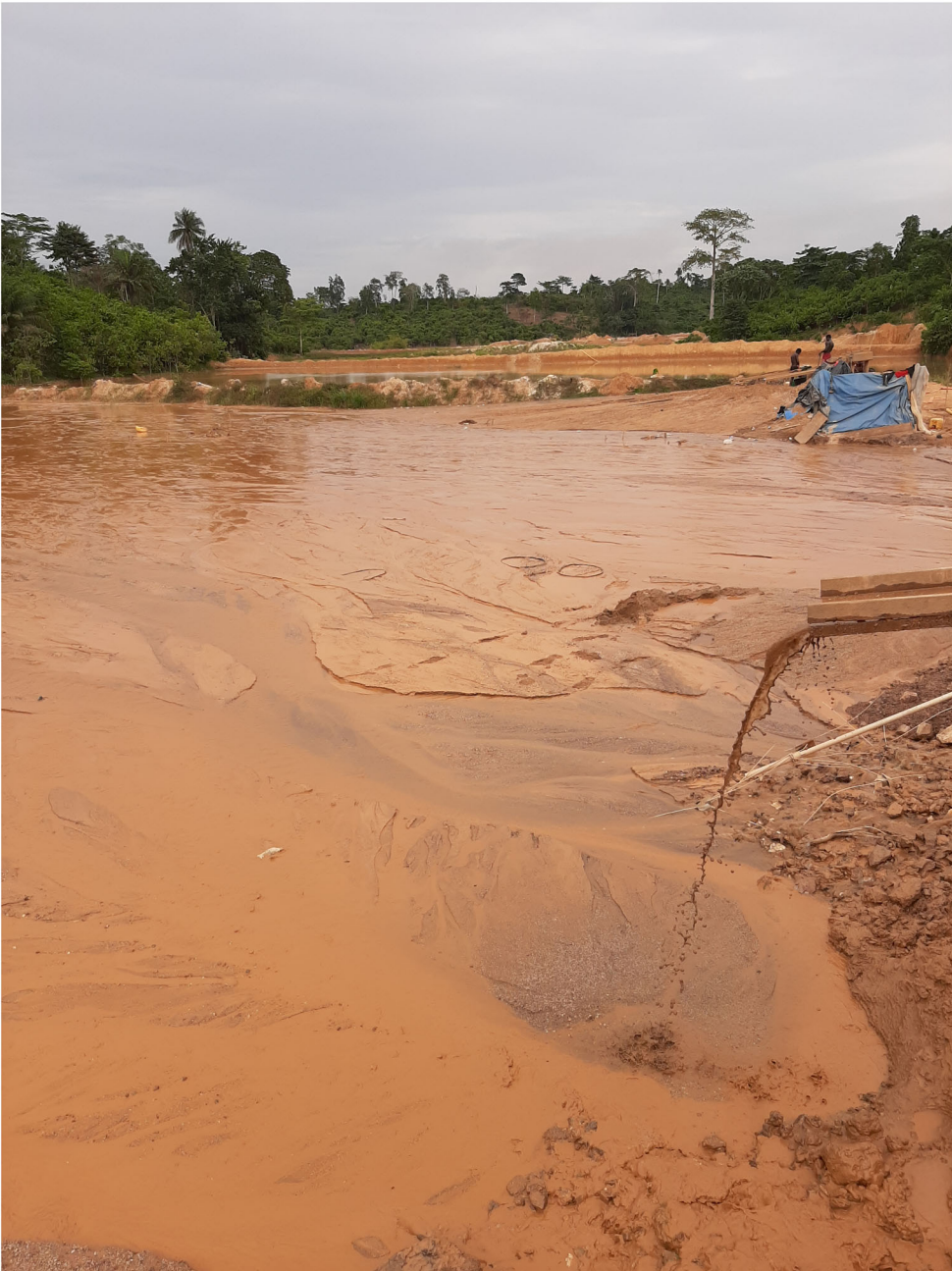
Figure 3. Mining effluent and flooding, Asankranbreman, Ghana, April 2022.

rather than the Ghana Forestry Commission because they said their attempts to register via the state agency were routinely ignored by local-level bureaucrats staffing these offices. Farmers attributed their lack of success to their low social status. One farmer even doubted that the Ghana Forestry Commission desired to facilitate registration. The farmer reasoned that tree ownership would reduce the number of trees available for