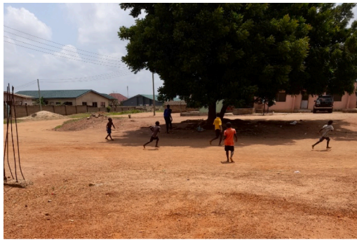
Playing under a shady tree