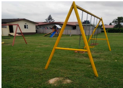
Manet Ville private park