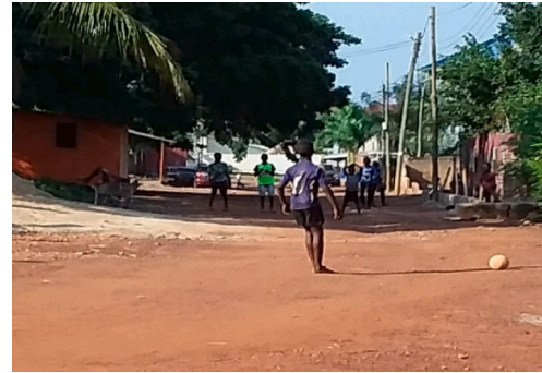
Playing on neighbourhood less busy and dirt road