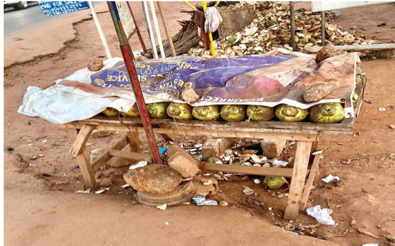
Figure 3. Fresh coconut stored on a table in the sales environment overnight.

Antioxidant effect of 71.9%, anti-inflammatory and analgesic effect of 65.7% and the benefits of preventing oxidative stress (reduces systolic pressure, lowers triglycerides and free fatty acids) of 60.0% were rated low in terms of awareness level. Majority, i.e., 90% of consumers indicated their source of knowledge on the health benefits through various radio and television health programmes. Once a consumer becomes aware of the benefits he/she derives from consuming coconut and its nutritional value therein, it may lead to knowledge accumulation which in turn may challenge already held constructs concerning the product, hence its subsequent patronage and consumption.