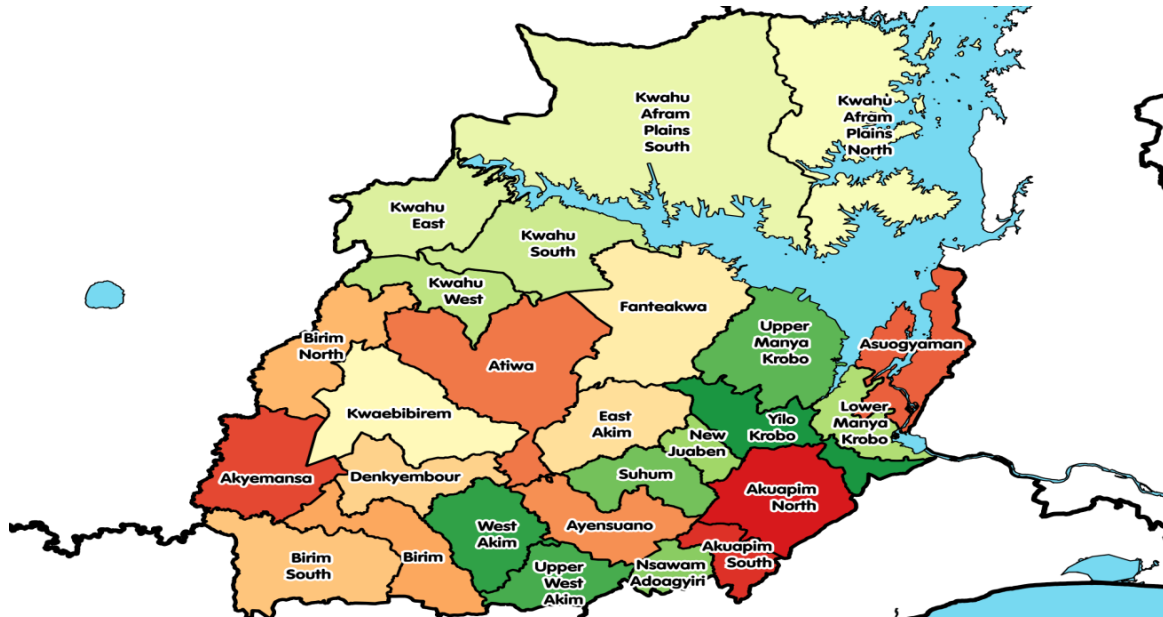
Figure 2 Map of the Eastern Region of Ghana Showing District Divisions

The Eastern Region of Ghana has a cataract surgical uptake rate of about 56.7% (Aekuaku-Dogbe et al, 2015).