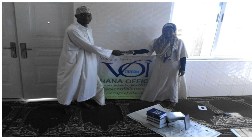
Fig 4: Qur'an stands of Voice of Islam on the 2 nd day of Zakir Naik's visit at the Elwak stadium in October, 2014