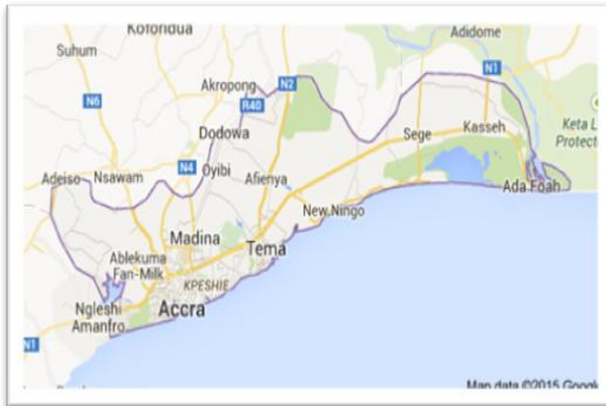
A map of Greater Accra region 121