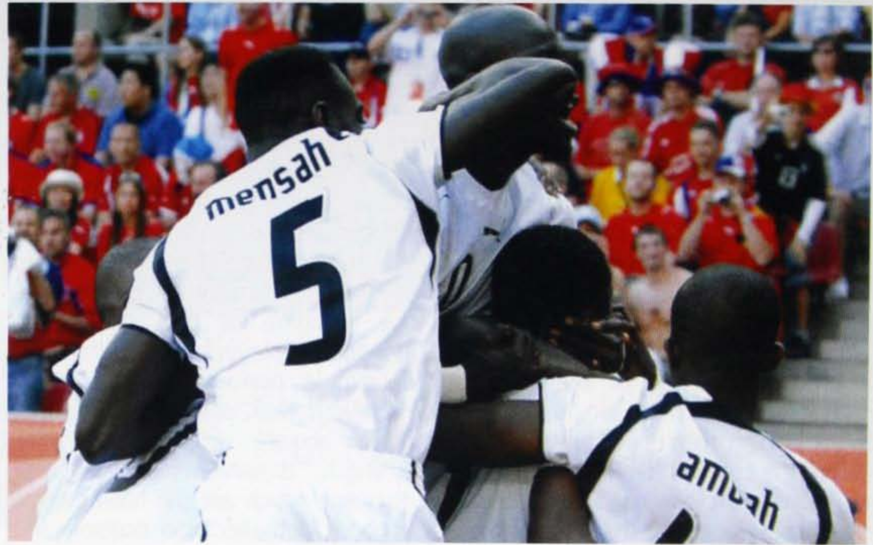
Fit, Competitive Ghanaian Footballers

Nutrition and fluid replacement are key issues in a sport like soccer. The main source of energy is glycogen (a complex polymer of glucose), which is derived from carbohydrates and stored mainly in muscle. Muscle glycogen stores decline during training and matches and considering the fact that each team would play matches after a few days' interval, the quality of the players' meals and timing should be right to optimize glycogen stores in muscle. Low levels of muscle glycogen are associated with fatigue and there is evidence that increasingly low glycogen stores as the game nears its end is one reason why fatigue in football leads to more goals, more injuries, poor skill and poor decisions late in the game. Muscle glycogen stores can be best replaced in between training sessions and matches by high carbohydrate meals. A typical meal eaten during the competition should comprise 65% carbohydrate, 20-25% fat and 10-15% protein. Repletion of glycogen stores in muscle is best done immediately after exercising. When eating is delayed after two hours glycogen repletion is not as rapid. During training and matches