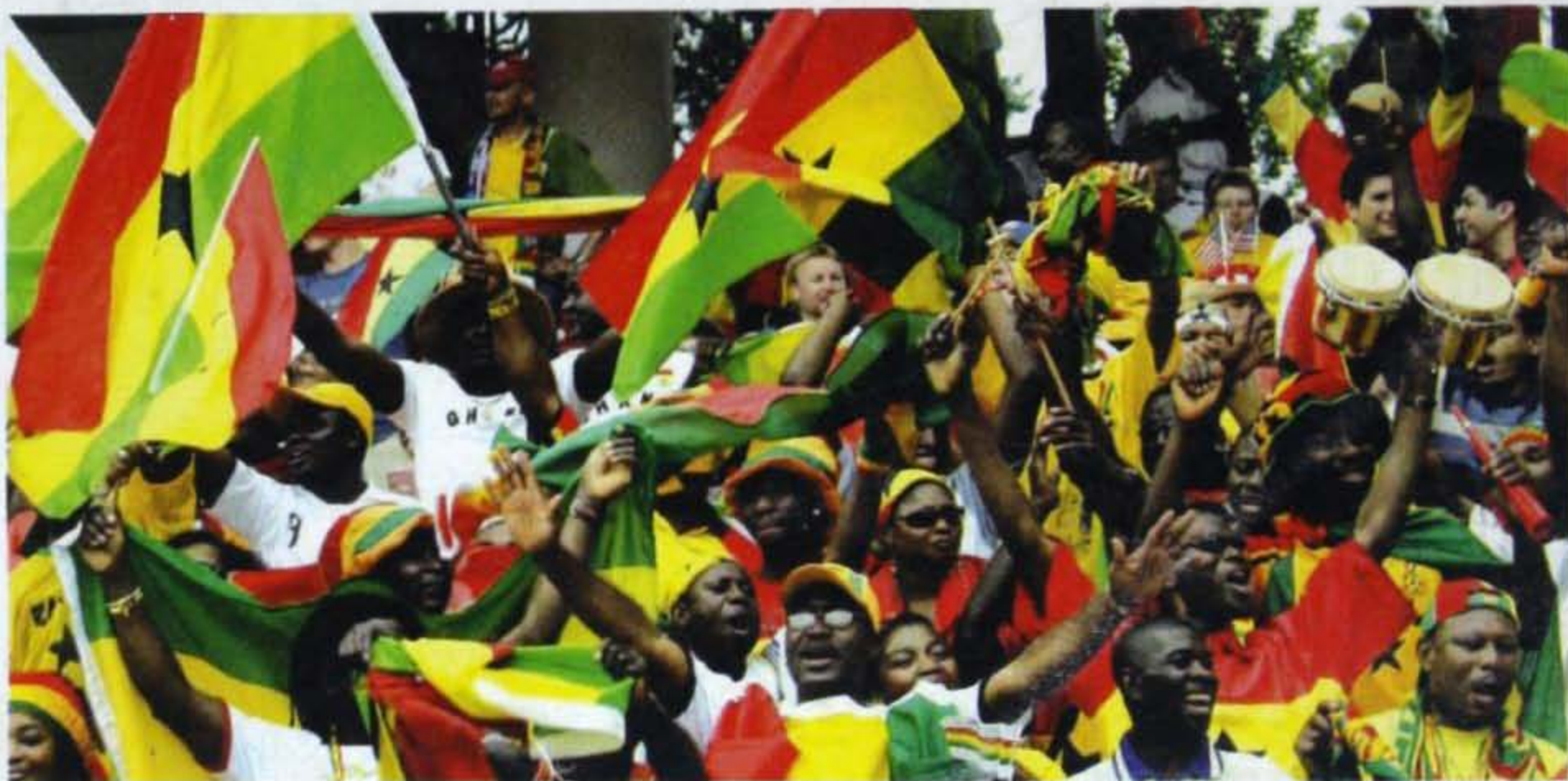
Jubilating Ghanaian Soccer Fans - Germany 2006