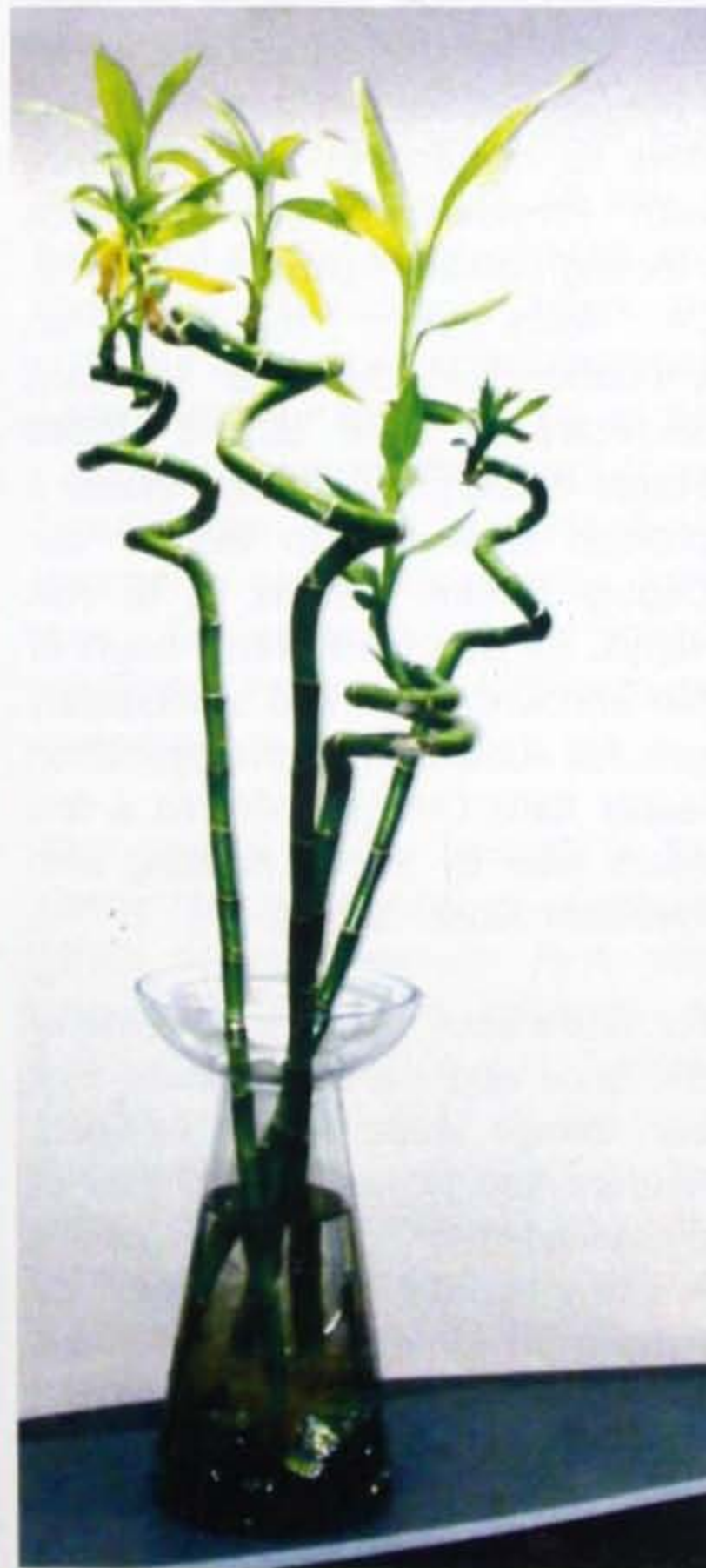
Water Propagated Bamboo

Secondly, in the first paragraph of the third column of page 23, Uncle Ebow discusses the issue of an alleged bribe taken by some old politicians during the "Third Republic", for which they went to prison. What Uncle Ebow fails to mention is that