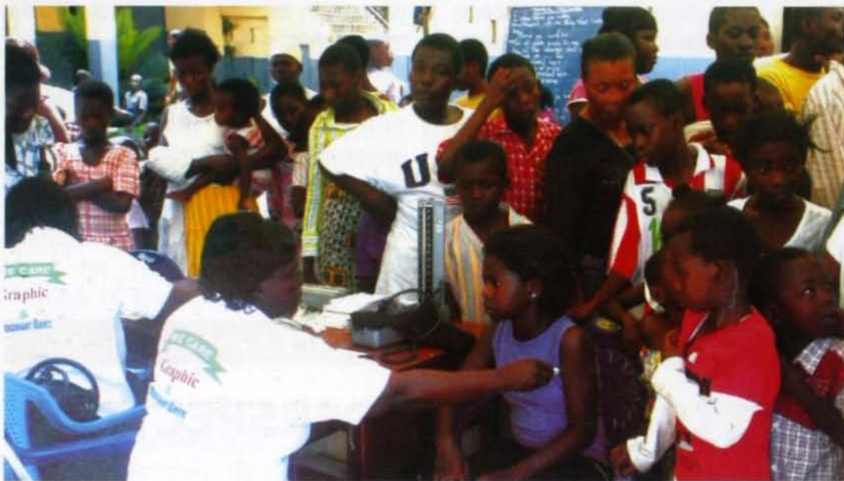
Public Health Screening

A complete physical examination should be done and this should include a detailed musculoskeletal (muscle, bone and joint) assessment. Finally taking blood, urine and stool samples for various laboratory