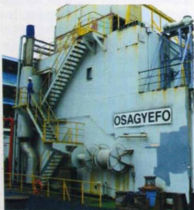
Osagyefo Power Barge

The main energy resources that have been developed and exploited extensively in the world to date are fossil fuels, coal, oil and natural gas, all of finite quantities and subject to