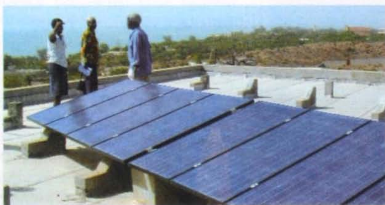
Celebrated Ghanaian Novelist Ayi Kwei Armah taking visitors round Solar Panel Installations at the Rooftop of the Per Ankh Building in Popenguine, Senegal. Solar Energy provides electricity for the entire building.

The key drivers of the increased use of biofuels throughout the world are energy security, local agricultural