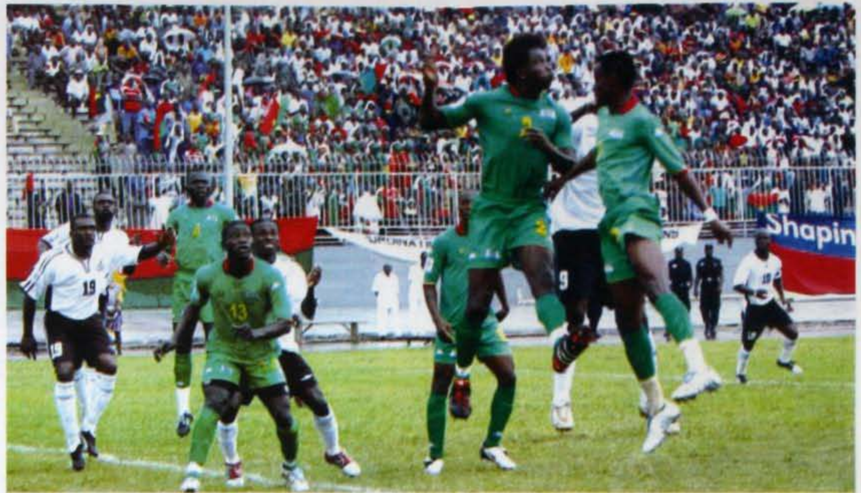
Black Stars in a Friendly Match

Increasingly also, in the context of African cup competitions, there is the illogical deduction that the host nation invariably wins the tournament, which has added to its lure and attractiveness to the citizens of the host country. The historical examples of Egypt and Ghana in earlier editions, South Africa in 1996, and most recently Tunisia and Egypt in