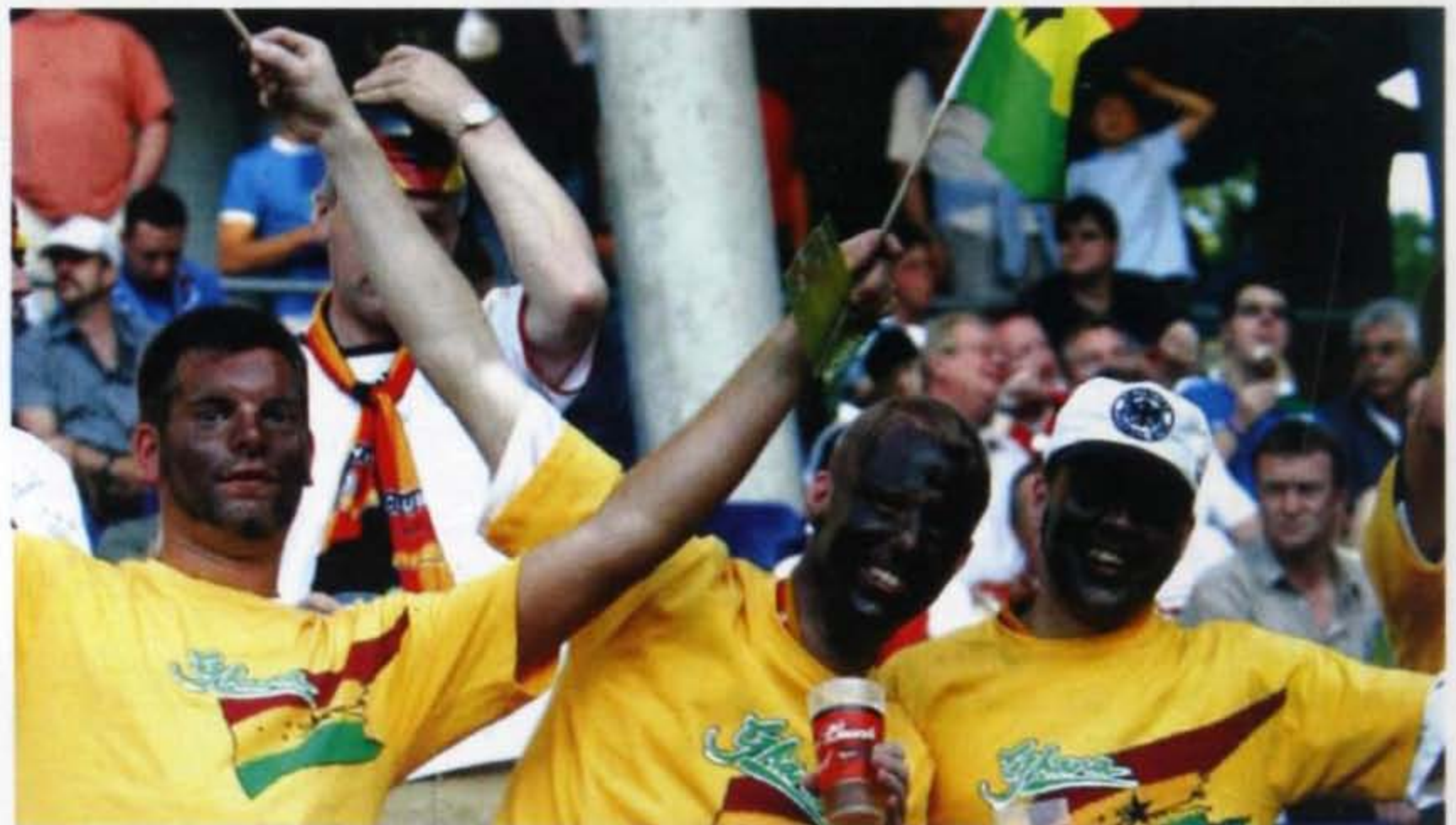
Black-faced German Fans Celebrating Ghana's World Cup Success

The country has, since the return of constitutional rule in 1993, enjoyed the goodwill and respect of the international community through the cultivation of democratic principles and practices in our domestic politics. This has gone a long way in endearing the country to a large segment of the international community as a peace-loving society. The decision by the Confederation of African Football (CAF) that Ghana should host the tournament is also a demonstration of the trust in the country's leadership, maturity and ability to handle a tournament of such magnitude. One critical factor in the decision-making process obviously is the stability that