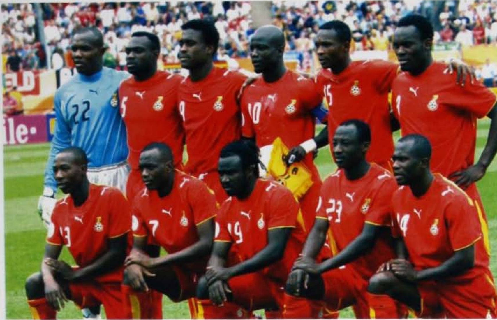
Ghana Black Stars World Cup Team - Germany 2006

community that it can be trusted to host Africa and the rest of the world without any dire consequences. The proverbial Ghanaian hospitality must overflow to the brim, law enforcement agencies must assist in seeking redress on matters relating to human rights violations and abuses whether the perpetrator is a Ghanaian, tourist or a visitor by any definition. Enforcement of the law must however not be done so as to denigrate the worth of the Ghanaian, undermine our institutions or dent our hard-earned international reputation. It is thus obligatory on the part of the Ministries of Information, Tourism, Communications, the Ghana Tourist Board, the relevant Embassies and High Commissions to collaborate with the authorities to educate their nationals and visitors on transportation, movement around the country, entry and exit points and where to seek help when necessary.