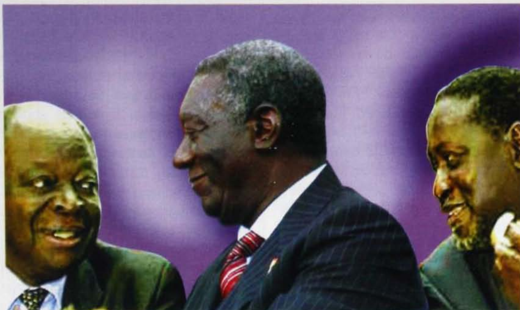
(L-R) Mwai Kibaki, John Agyekum Kufuor (AU Chairman), and Raila Odinga

The EU Election Observation Monitoring (EOM) team and other Western governments have concluded that the election was flawed because the ECK failed to establish the credibility of the tallying process to the satisfaction of all parties and candidates. According to the EU EOM, the result for the Molo constituency that was initially announced as 50,145 votes in favour of President Kibaki was later altered as 75,261 votes. The lack of transparency in the tallying process raised serious problems about the effectiveness of the election process (see voanews 2007; the commonwealth.org 2008 ).