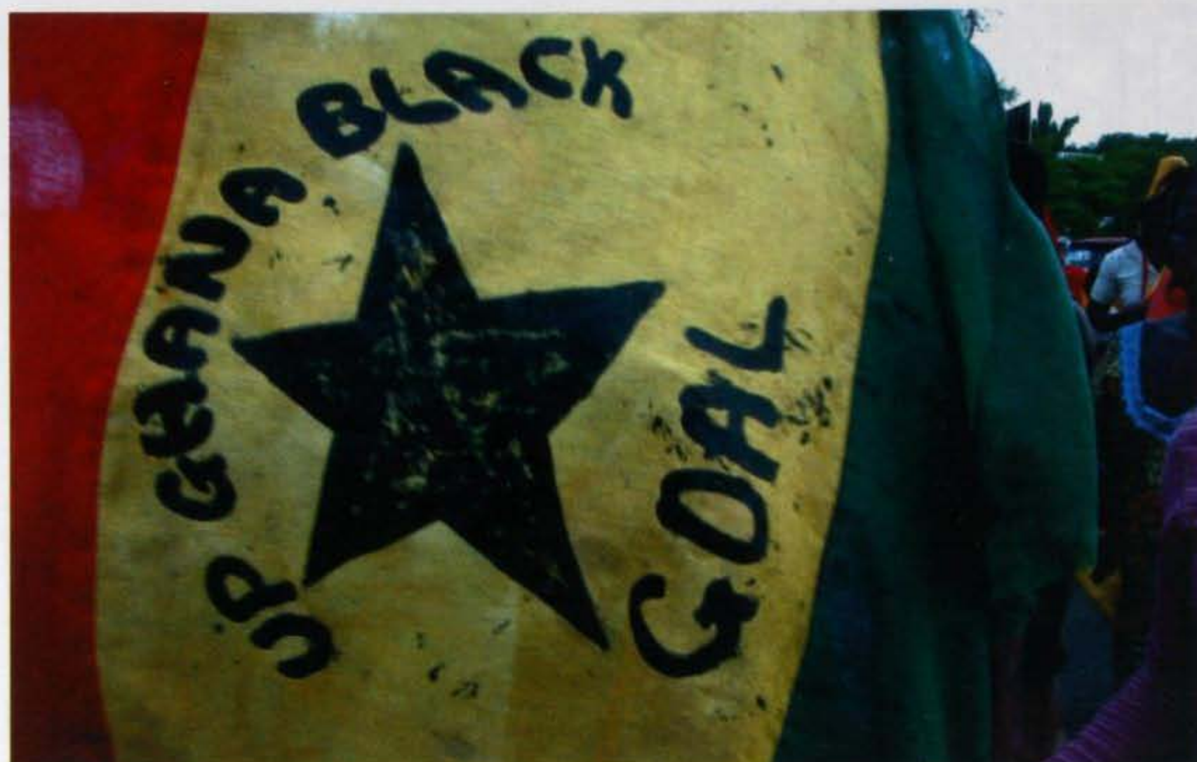
A Customised Ghana Flag - World Cup 2006, Accra

Inevitably, some of the African players become victims of the power struggle in diverse ways, for instance, sustaining serious injuries during such tournaments that require the intervention of their clubs. Some are unable to hold on to their positions due to competition from equally capable players from other regions. Unable to regain the confidence of their managers, they have to look for less glamorous teams, often leading to financial loss. Altogether, the