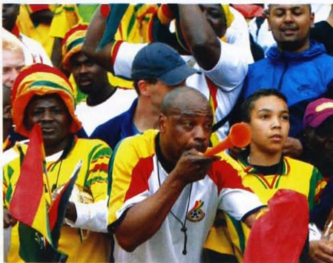
Ghanaian Soccer Fans in Germany

But as many noted, a game never ends at the stadium: its spirit spills over into the streets when jubilant or despondent fans congregate in bars,