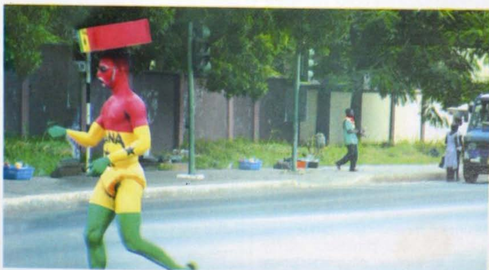
Body Make-Up Artist Celebrating one of Ghana's Wins during the 2006 World Cup

In all these, the onus of responsibility lies first and foremost with the Local Organising Committee (LOC) in collaboration with other principal stakeholders such as the Ghana Football Association (GFA), the National Sports Council (NSC) and other relevant agencies. It must be stated, however, that these activities and preparations are being done on behalf of the government of Ghana which cannot stand aloof or exhibit indifference. The Ministries of the Interior and Defence and other security agencies have critical roles to play in this regard, particularly when it comes to the deployment of personnel from the Ghana Police Service, the Ghana Armed Forces, the Ghana Fire Service and other auxiliary services. The experience of the country in disaster management in sports-related mishaps, for instance, the May 2001 Ohene Djan (then Accra Sports Stadium) disaster must serve a useful purpose in this regard.