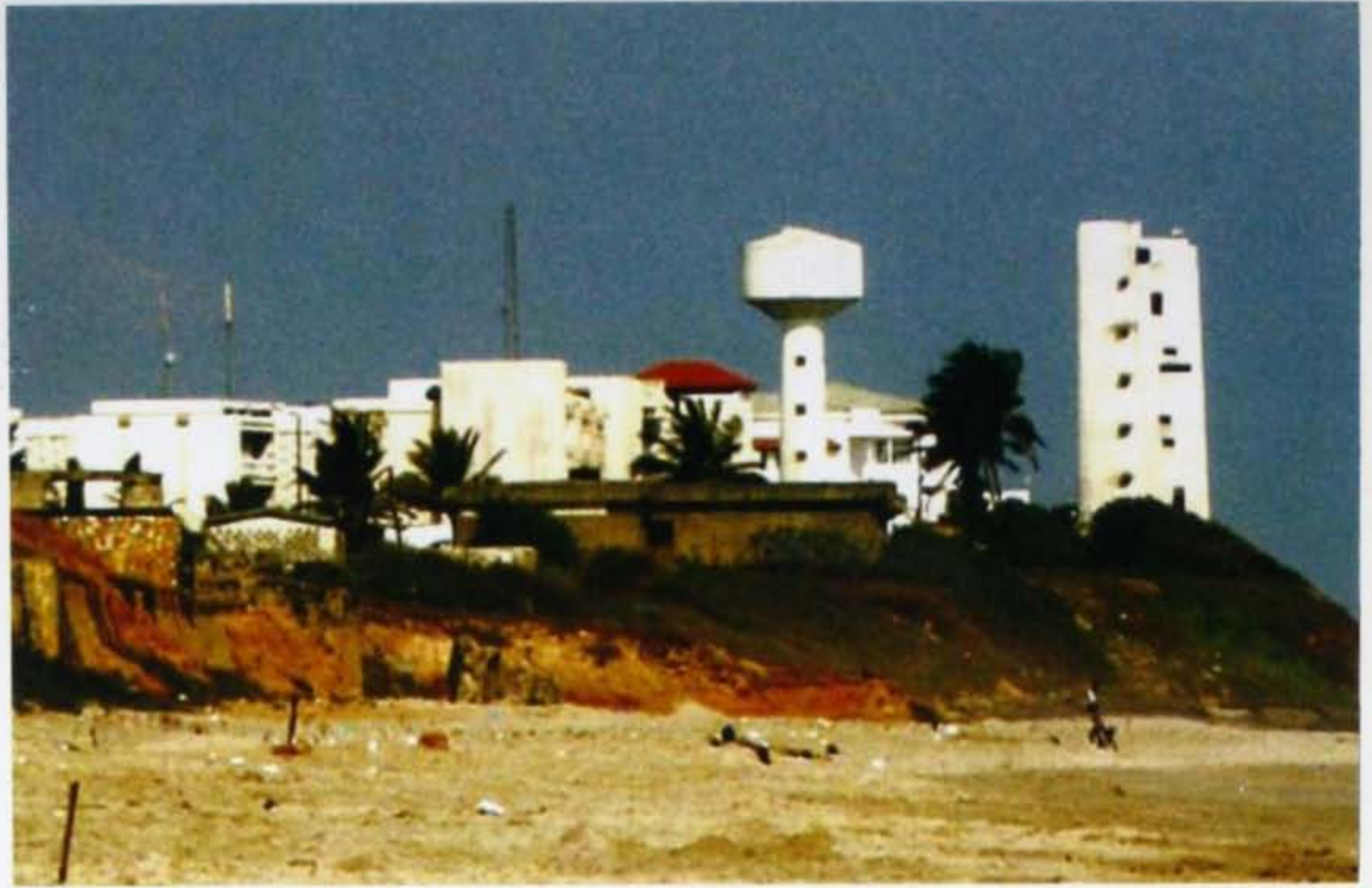
The Castle, Osu

One's frustration increases when one tries to transact business such as simply delivering a letter either to the Chief of Staff and Minister for Presidential Affairs or the Secretary to the Cabinet. The "outer" reception at the car park is not clearly marked and one is forced to ask some workers about its location. On entering the office and the letter is shown to the receptionist, one is told to send the letter to the "inner" reception, which is inside the Castle. At the Castle the "visitor" meets a security official who will ask that he/she sees another official in an adjoining room for his/her name and