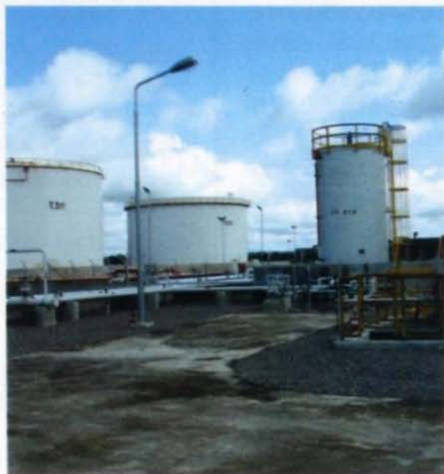
Bulk Oil Storage Facility

f. Intermittent Nature of Alternative Energy and Storage: Many alternative energy sources are often dismissed because they cannot be stored and because they are often intermittent (e.g., solar, wind). However when used in conjunction with another alternative fuel source, energy can be stored and used to supplement supply when the sun isn't shining or the wind stops blowing. Excess wind capacity, for instance, can be redirected to create energy through hydrogen fuel cells which can, in turn, supply energy when