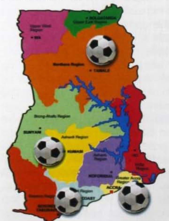
Ghana 2008 Soccer Stadium Locations

benefits and associated challenges to Ghana and Africa as a whole.