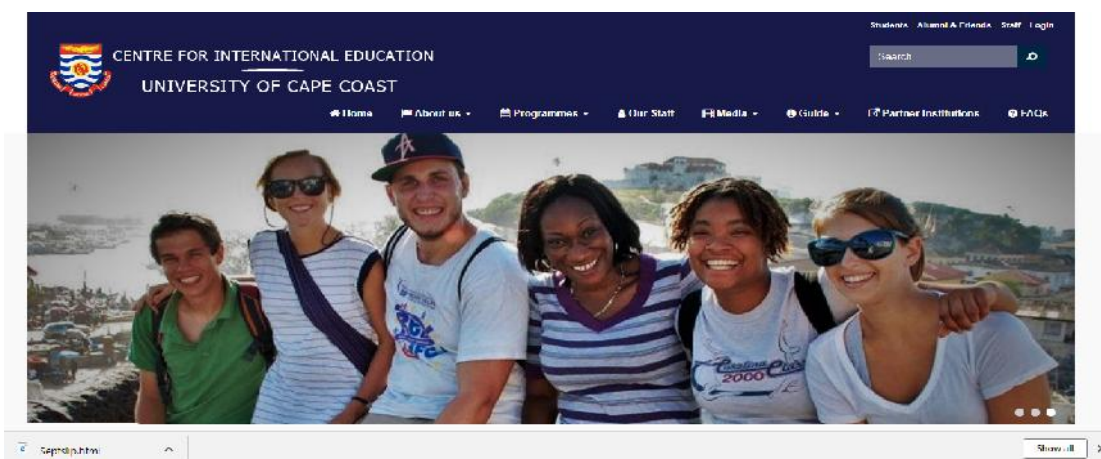
Figure 3. Photograph of international students on an excursion.

If it is the case that the verbal mode constitutes the organising frame of the discourse in the case of the UG's website, the reverse is true for UCC. In the case of this institutional discourse, constructed on the website of UCC, we see clearly that the visual mode is the central semiotic resource used in the discursive construction of the institution's identity. The visual mode is used to realise both claim expression and claim justification. Figure 3 will be used to explicate this position.