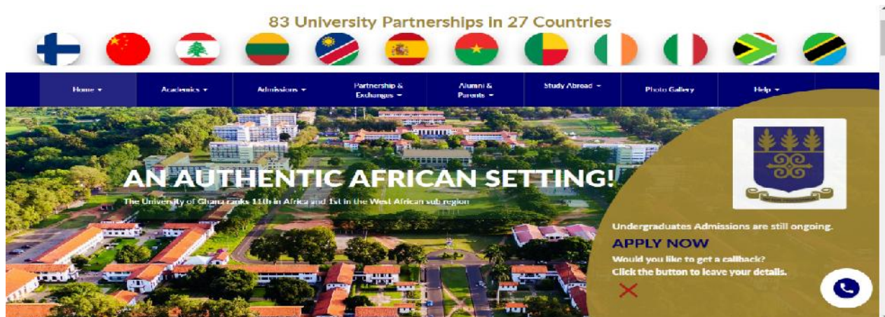
Figure 1. Aerial shot of University of Ghana's campus.

Given that two modes – the verbal and the visual – constitute the means for the discursive construction of identities on the websites of the selected institutions, it is important that the analysis attends to the ways in which these two semiotic resources are combined to construct the identities of the institutions being studied in this paper. We, therefore, begin this examination by looking at the relationship between the two modes, as seen in University of Ghana's website. In this context, the verbal and visual modes have been used in ways that position the verbal mode as the organising frame for the entire discourse. This is to say that the verbal mode is the semiotic resource of relative salience. This point will be illustrated by recourse to Figures 1 and 2.