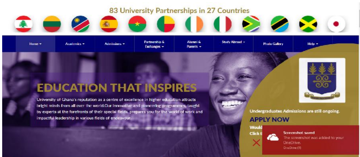
Figure 2. Advertising for admissions at the University of Ghana.