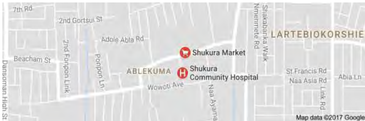
Figure 3.1: Location of the Shukura Community Hospital.

Location of the Shukura Community Hospital is shown in figure 3.1.