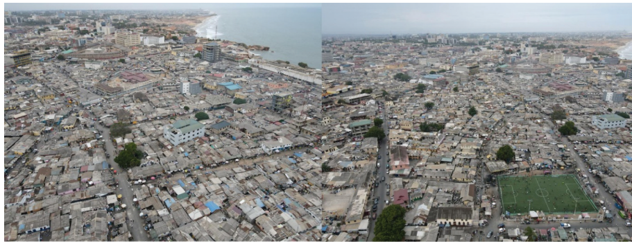
Figure 1. An aerial view of Ga Mashie.

Accra, and will use Global Positioning System (GPS) to map the commercial and built environment, including the locations of all food and drink outlets, health facilities and physical, religious, and social spaces.