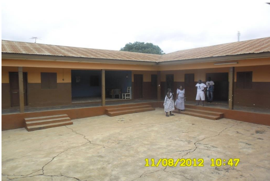
A portion of the place built by Akosa for the Benim community