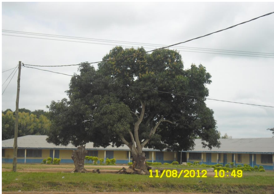
A section of primary school built by Akosa for the Benim community