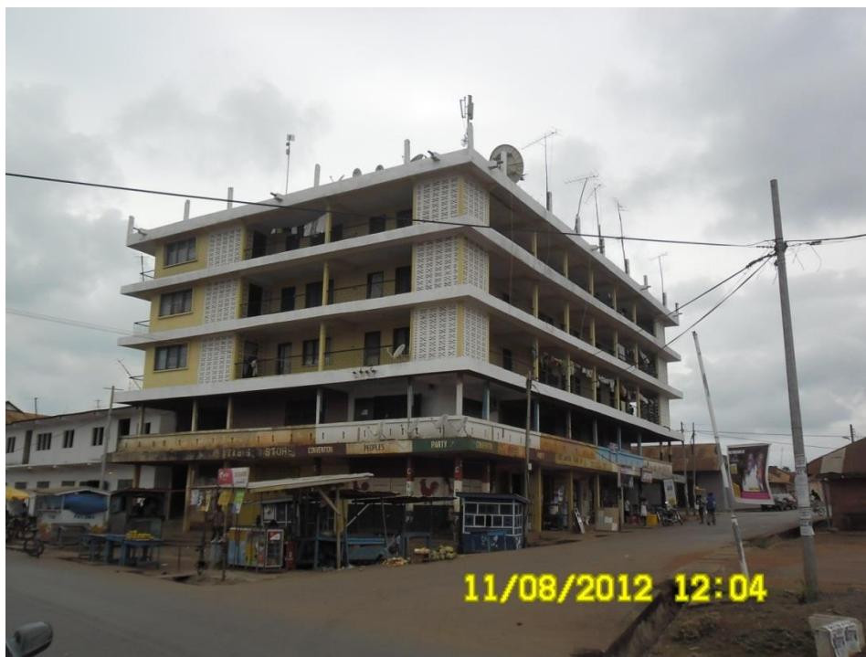
One of Akosa's houses in Mampong