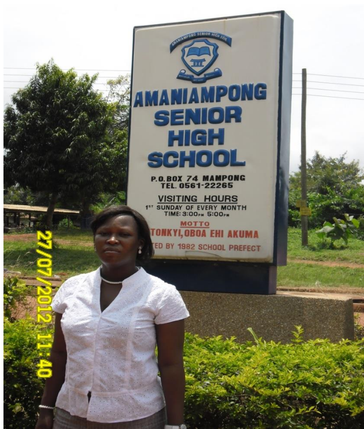
The researcher at the premises of Amaniampong Senior Secondary High School