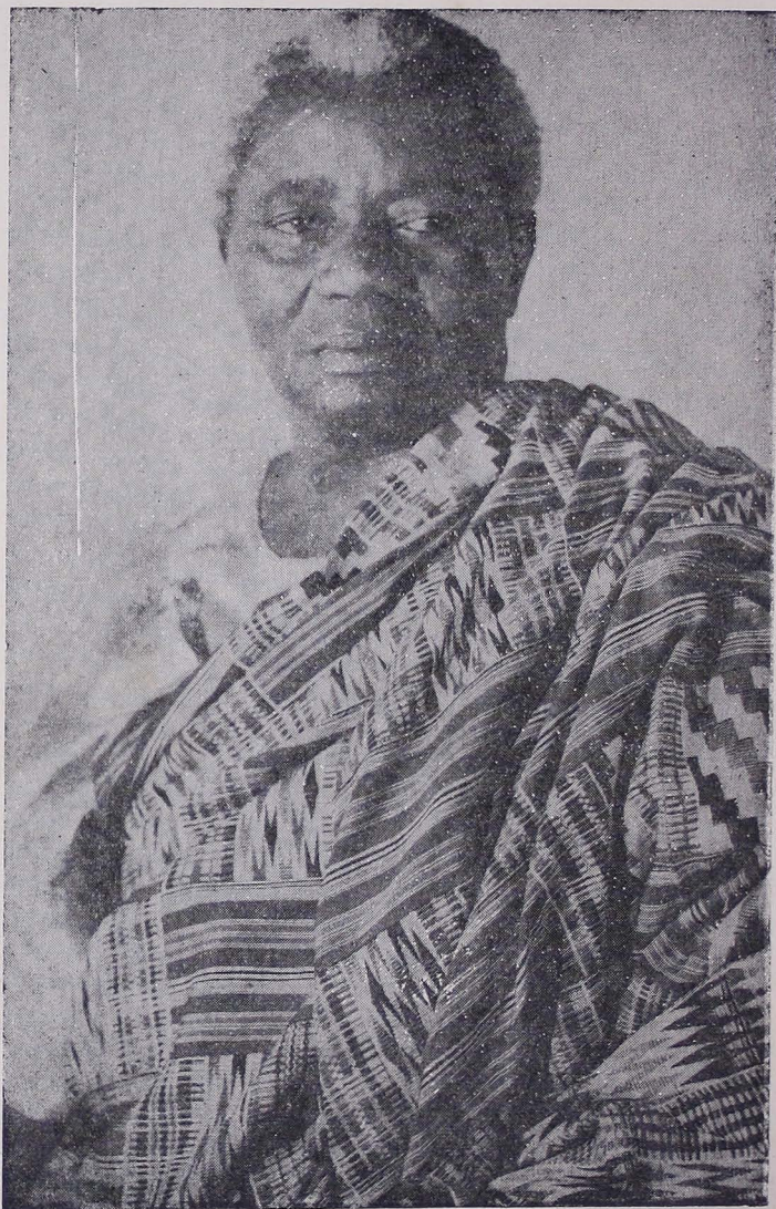
DR. J. B. DANQUAH