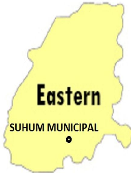
Figure 3.2 Map of Eastern Region Showing Suhum Municipality.