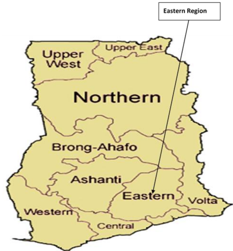
Figure 3.1 Map of Ghana Showing the Eastern Region