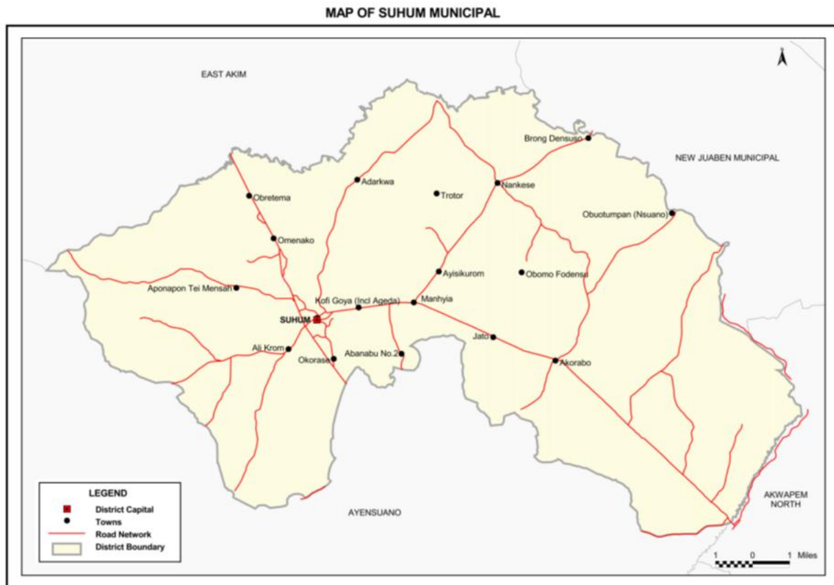
Figure 3.3 Map of the Suhum Municipality