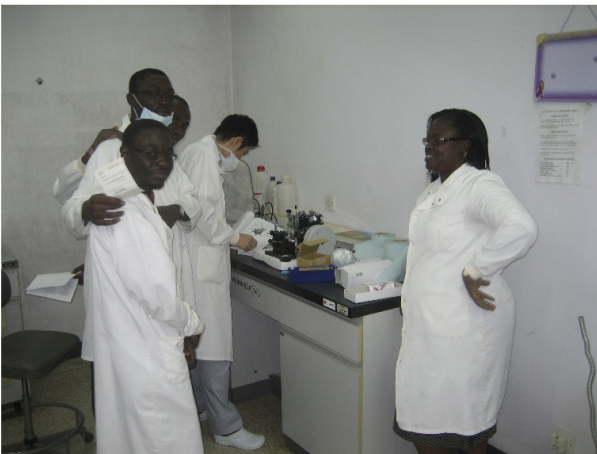
Fig. 2. Researchers of TMDU are dispatched to Ghana to train young researchers of NMIMR. Technical transfer from Japan to Ghana is one of the activities in the project.

ogy, Electron Microbiology, Epidemiology, Immunology, Nutrition, Parasitology, and Virology. The main institutional scope of research activities is directed at infectious diseases, but research fields are expanding and now, as the disease structure changes in Ghana, include metabolic disorder, hypertension and other diseases.