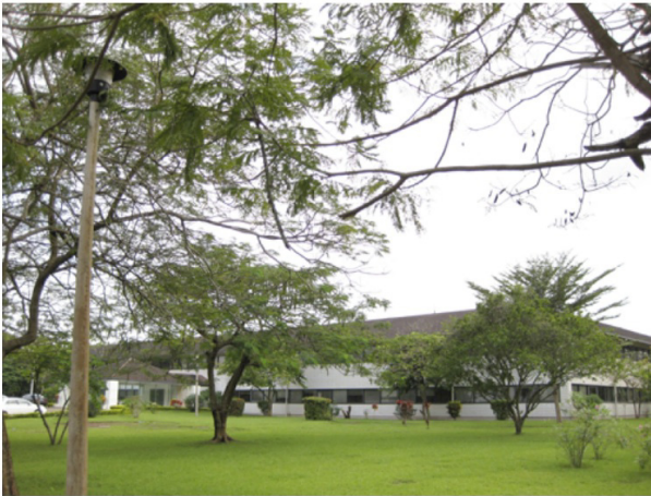
Fig. 1. Noguchi Memorial Institute for Medical Research. It was donated from the Japanese Government in 1979 for research on infectious diseases in Ghana.