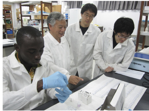
Fig. 4. Undergraduate students of TMDU are dispatched to Ghana to have experiences of infectious disease research under the instruction of TMDU and NMIMR researchers.

sites. A matter of concern was the thinking of patients both in urban and rural areas. It was possible to purchase medicines at drug stores without prescription and some still requested CQ for treating malaria (Fig. 3) [12]. Since treatment using a single artemisinin-derivative drug was observed, concerns arose about the emergence of artemisinin-resistant malaria parasites. Results suggest that it is necessary to provide both medical and nonmedical residents with precise ACT-related information more properly for ACT to remain effective in treating malaria in Ghana.