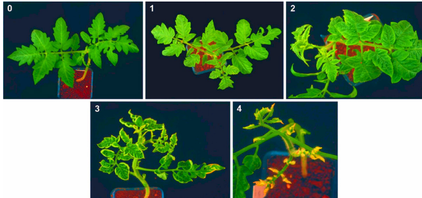
Plate 1. Tomato leaves showing varying degrees of symptom severity from TYLCV infection. Symptom scoring scale: 0-4 according to Friedmann et al. (1998)

Severity of the symptoms was estimated using the formula advanced by Njock and Ndip (2007).