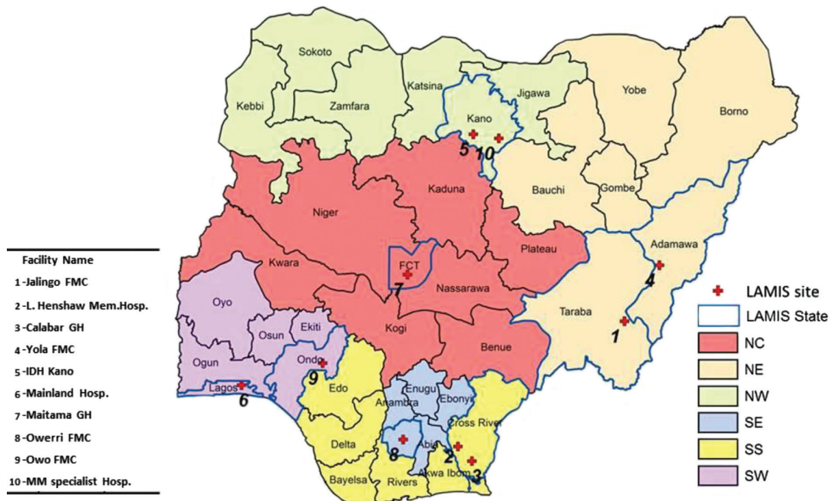
Figure 1. Locations of hospitals included in the study.

The site selection criteria for this study were (1) ART sites using an EMR system; (2) hospitals providing comprehensive ART services to adults; and (3) hospitals starting ART services by January 2007. All 10 hospitals that piloted LAMIS met these criteria and were included in the study. Four of the hospitals were secondary and six were tertiary level facilities. There was at least one hospital from all six regions in the country. Figure 1 shows names of the 10 hospitals included in the study and their locations in the country.