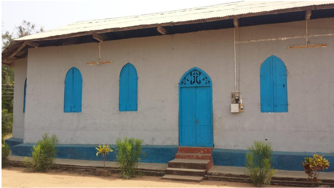
Presbyterian Church of Ghana Bethania Congregation Mayera- Osofoi Aman, this is Carl Christian Reindorf's first congregation he pastored after his ordination in 1872.