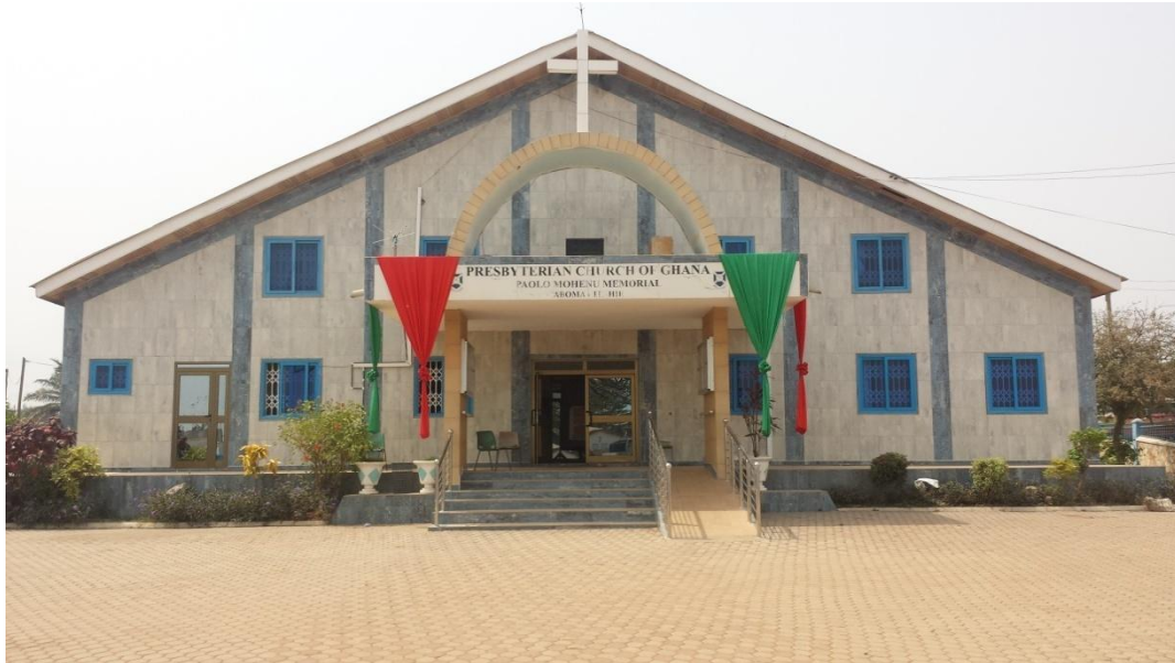
This is a Presbyterian Chapel at Teshie Aboma named after Paul Mohenu.