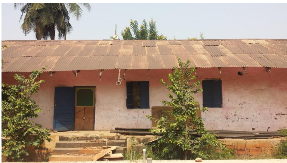
This is the office Carl Christian Reindorf used during his tenure.