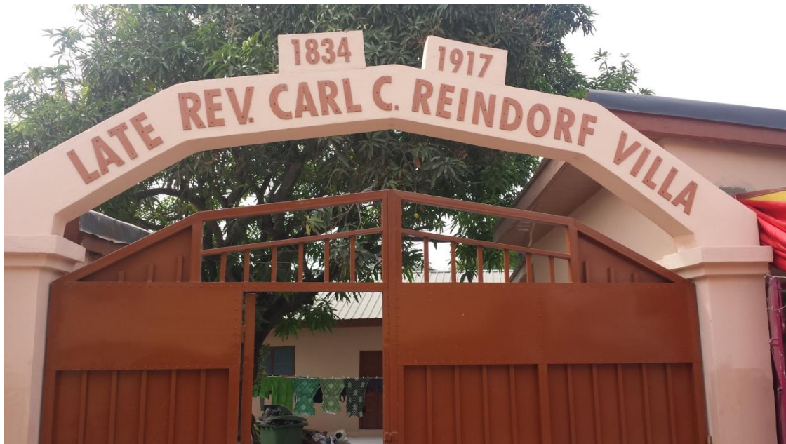
This is a renovated family house of Rev. Carl Christian Reindorf at Osu.