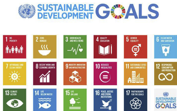
Fig. 1. Sustainable development goals (SDGs).