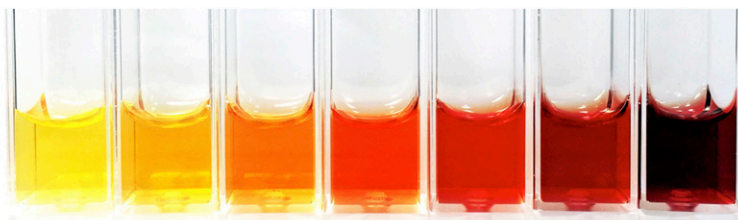
FIGURE 3 Methods to determine hemolysis levels in plasma or serum. A representation of plasma or serum within increasing levels of hemolysis is shown. Below the images are the corresponding Hb concentrations (means \pm SDs; n = 3 ) and approximate RGB color model values of the corresponding plasma or serum. The iron values listed for the lowest category of hemolysis reflect the clinical reference range in nonhemolyzed plasma or serum (0.5–1.8 mg/L) (20). A_{540nm} , absorbance at 540 nm; Hb, hemoglobin; RGB, red, green, blue; <DL, below the detection limit of 0.05 absorbance.