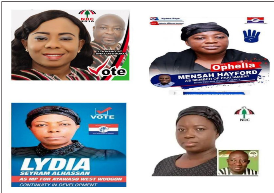
Figure 5. Samples of campaign posters for widow succession politics in Ghana.

Wuogon, Mfantseman and Temppane) to appeal to the emotions of the constituents for support (Figure 5).