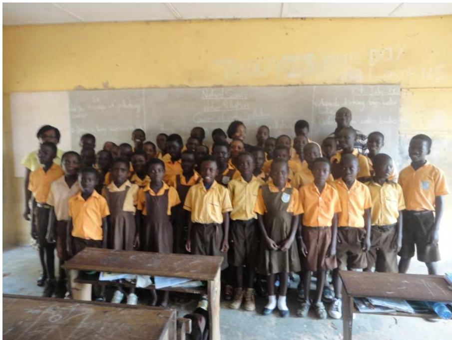
A group picture with the class