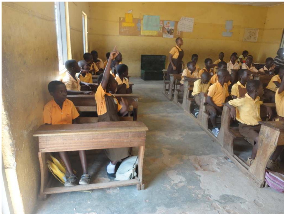
A pupil answering a question