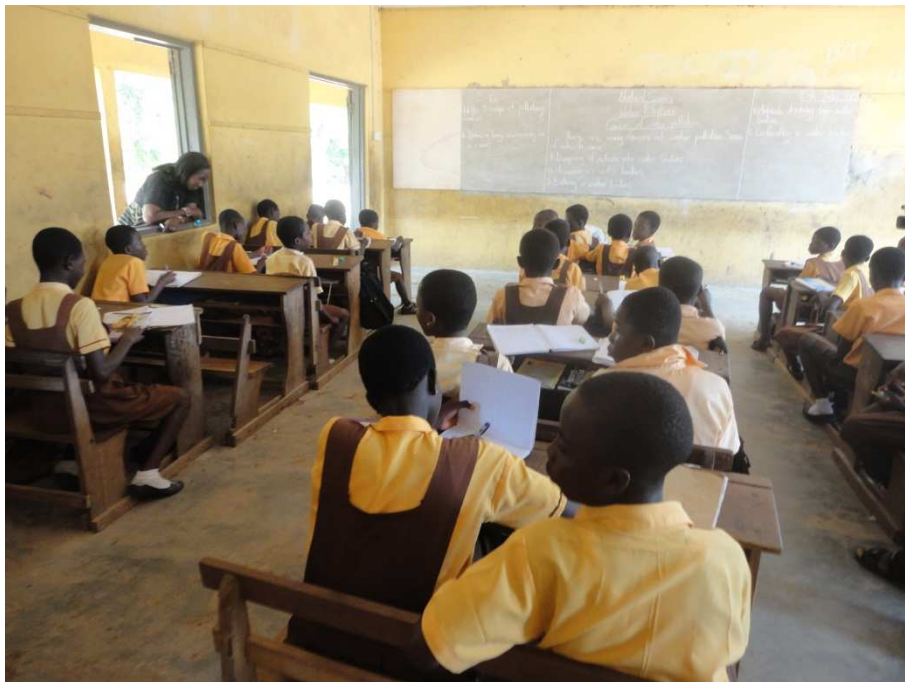
The head teacher of the school observing the lesson