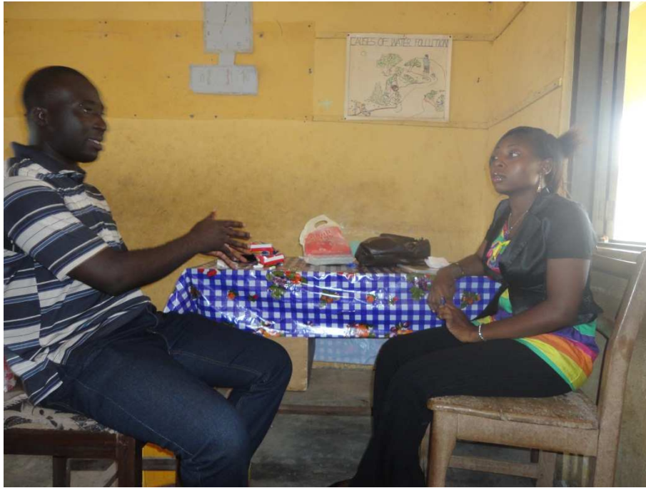
Interaction with the teacher