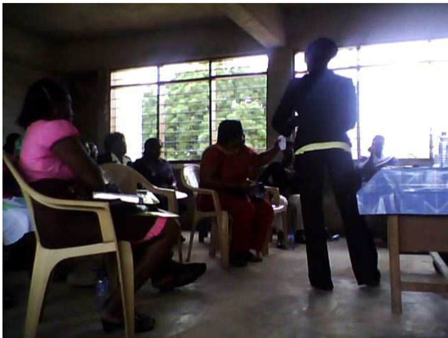
A demonstration teaching by a participant