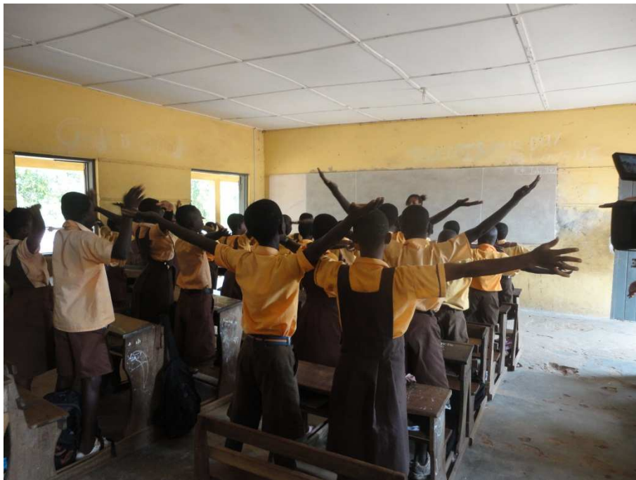
A warm-up exercise before the lesson