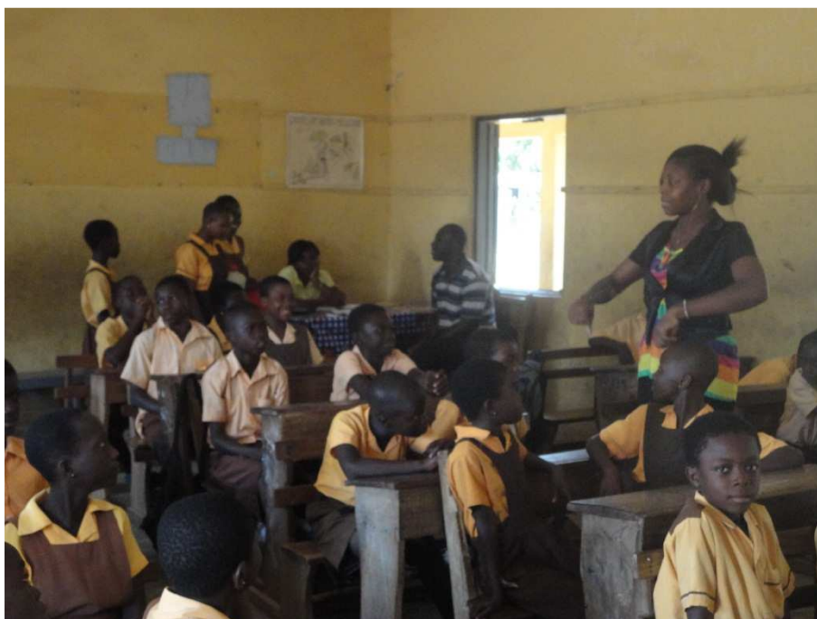
Storytelling time – the teacher narrating a story as a mode of instruction