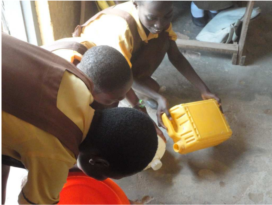
Role play – some pupils fetching water from a river