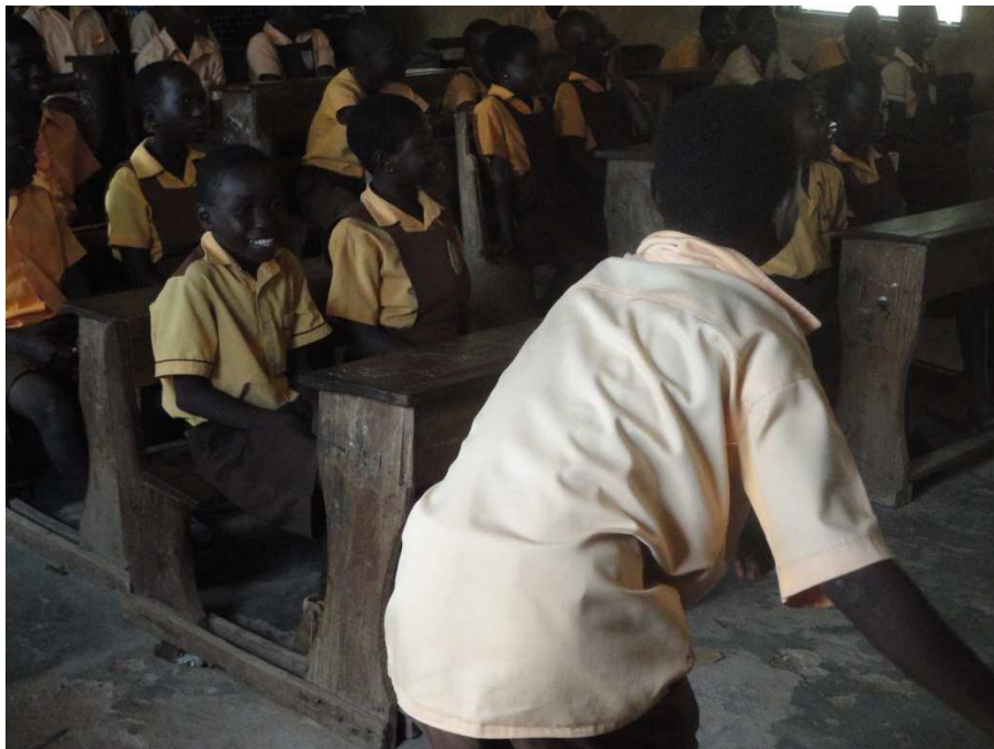
While another pupil swims in the same river