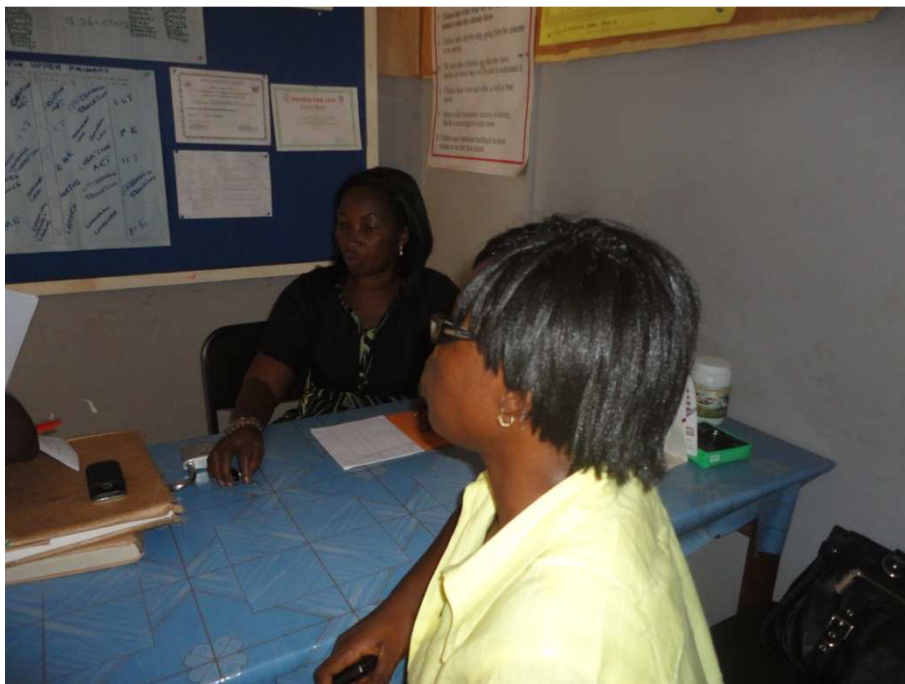
Interaction with the head teacher