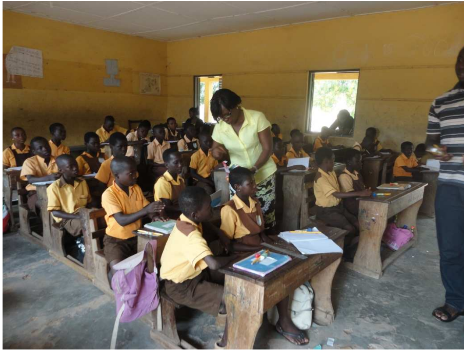
Learning materials for pupils