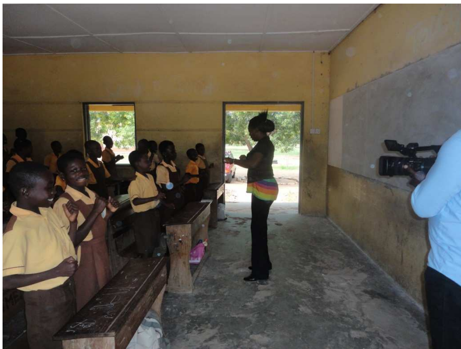
Pupils excited as they do the warm-up exercise