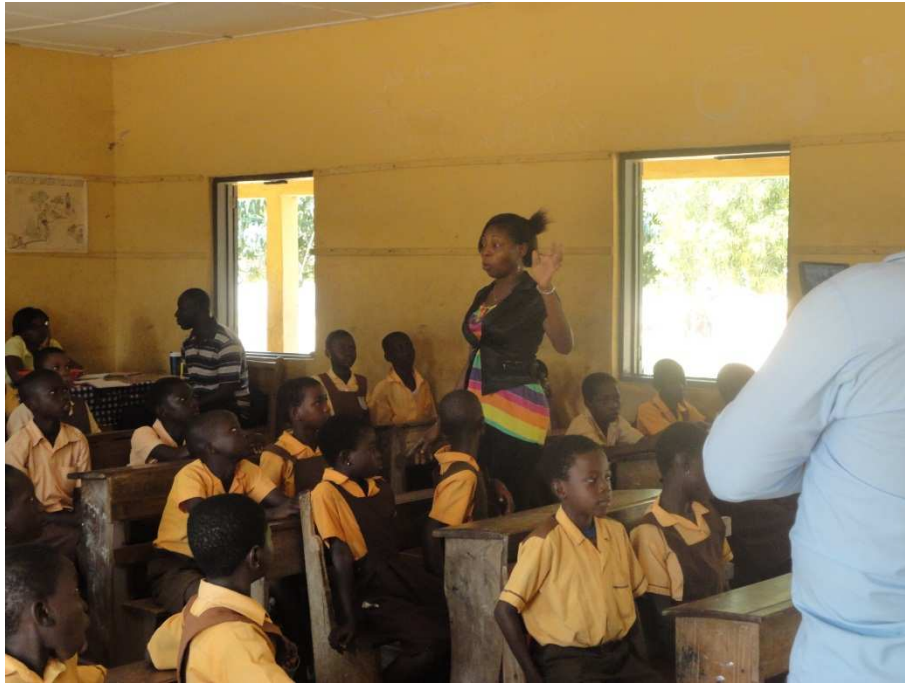
Pupils engrossed in the story