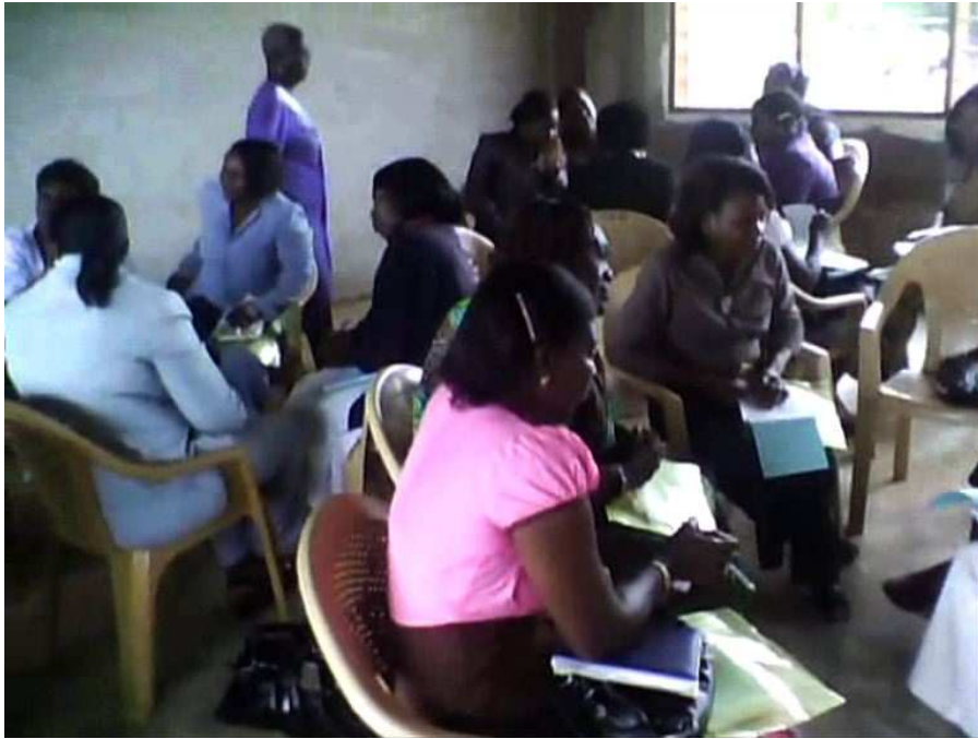
Participants of the training workshop in a group work with resource person supervising