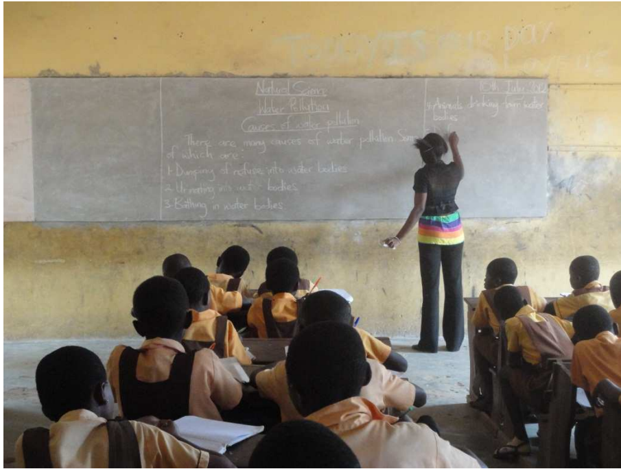
Teacher giving notes to complement the story