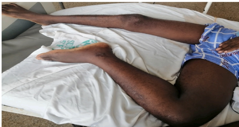
Fig. 1. A picture of the patient pre-operative showing limb posture and limb circumference discrepancy.