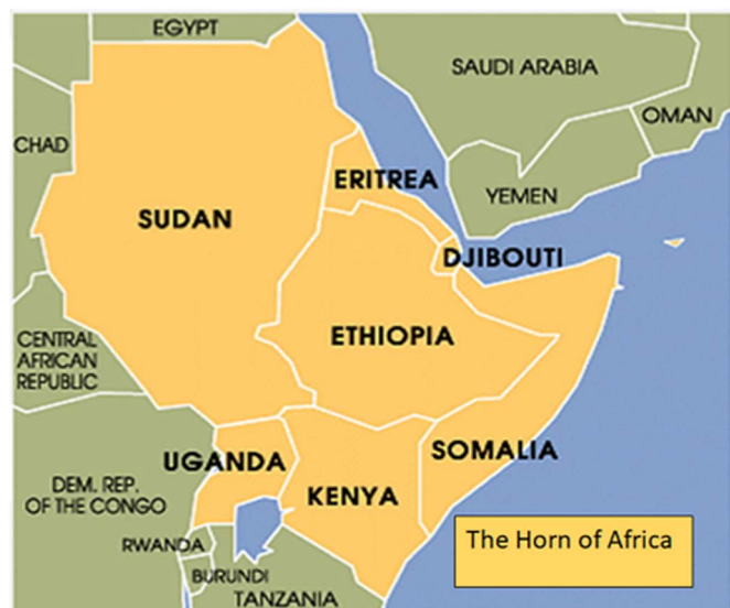
Fig. 1. The study area (Horn of Africa).

The target of this paper is to review environmental impacts of conflict in the Horn of Africa (the countries of Djibouti, Eritrea, Kenya, Ethiopia, Uganda, Sudan and Somalia) (Fig. 1), and to review the role of climate variability in increasing or decreasing conflicts. This was done in the context of a comprehensive review, the process of collecting, appraising, and then synthesizing data from a large number of sources. The main method for selecting the literature was cumulating research findings across different studies on the same issue which, in our case, was “environmental impacts of conflict”. The methodology employed