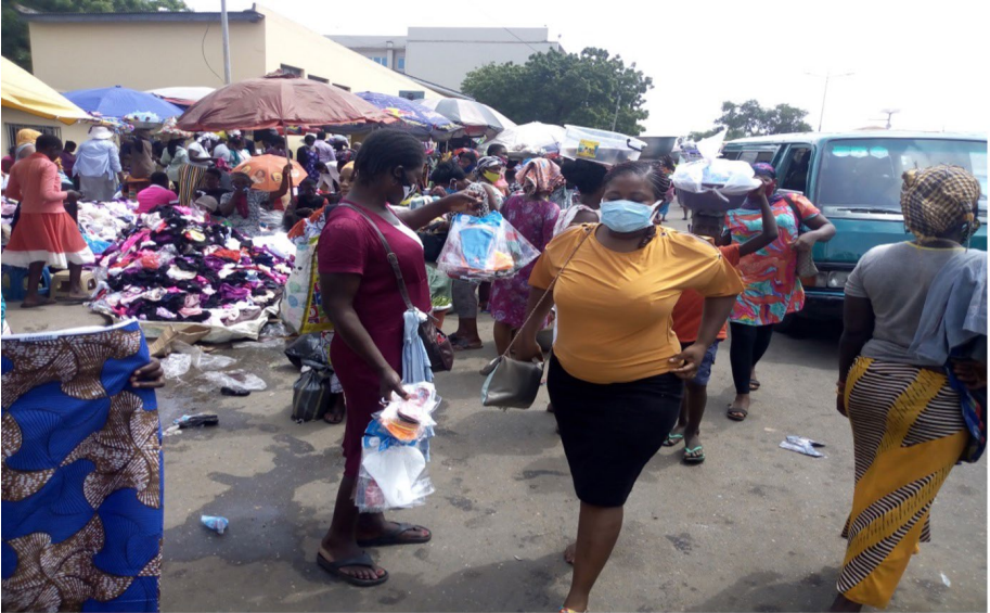
Figure 2. IT selling face masks.

The differences in prices reflect the types and makes of face masks being offered for sale. Face masks made from local fabrics generally looked less sophisticated and were offered for sale at comparatively lower prices than other, more sophisticated ones. The ones produced from local fabrics enjoyed higher patronage because of their affordability, which translated into high profit margins. Apart from face masks, another item of PPE that enjoyed high patronage was alcohol-based hand sanitizer (Figure 3).