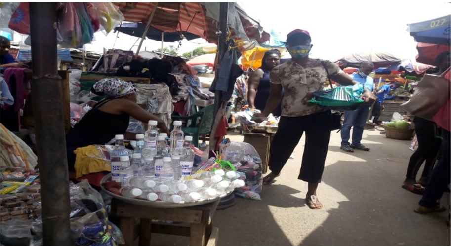
Figure 3. IT selling hand sanitizer.