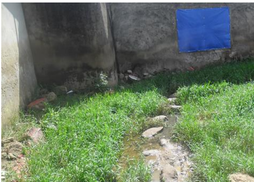
Fig. 2 Houses built on flood prone land

poverty, corruption and bureaucracy as important barriers. A tour around some of these areas revealed some houses sitting on pools of water (Fig. 2), buildings that were possibly approved without knowledge of the nature of the land or soil. Community members also indicated the presence of mosquitoes throughout the year because water from the bathrooms and domestic chores sits behind the houses and becomes a breeding ground. These areas are increasingly being used, putting human lives and property at risk as climatic hazards are expected to increase.