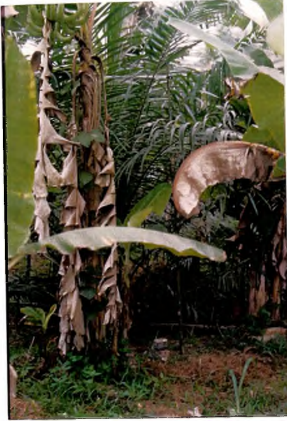
Plate 3.3: Oil Palm intercropped with plantain (T 3 )