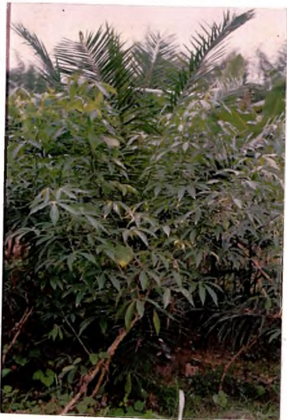
Plate 3.2: Oil Palm Intercropped with cassava (T 2 )