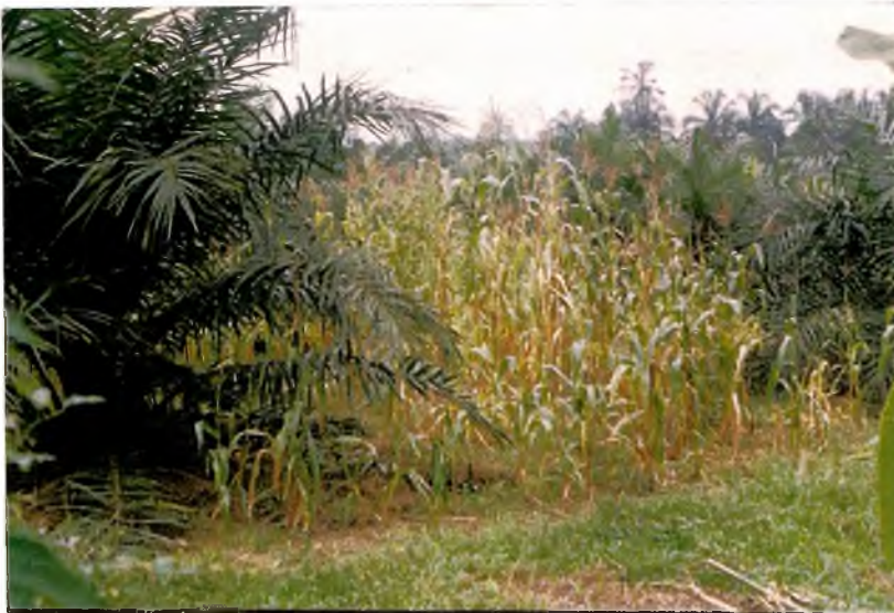
Plate 3.4: Oil Palm intercropped with maize (T 4 )