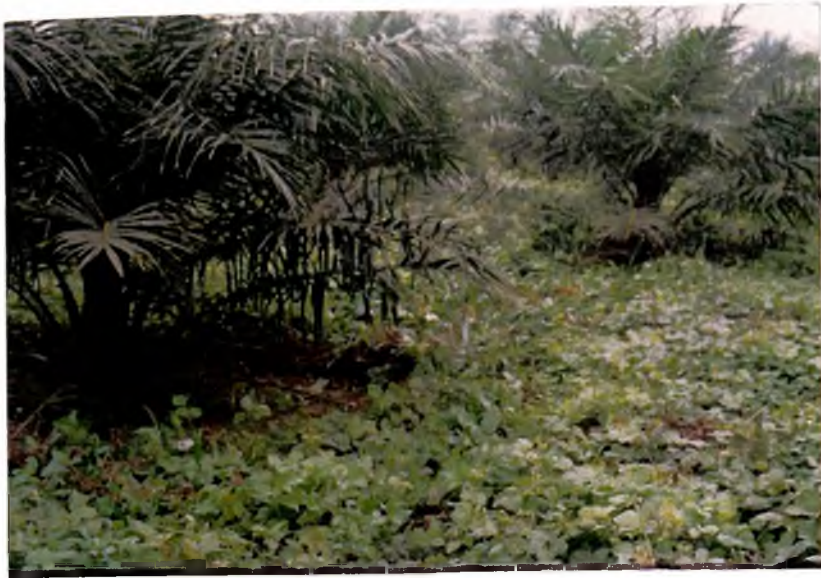
Plate 3.1: Oil Palm with Pueraria Cover Crop (T 1 )