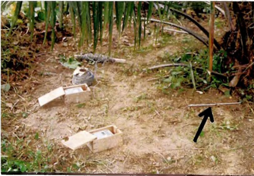
Plate 3.6 Tube Solarimeter installed beneath the canopy of the oil palm (arrowed)