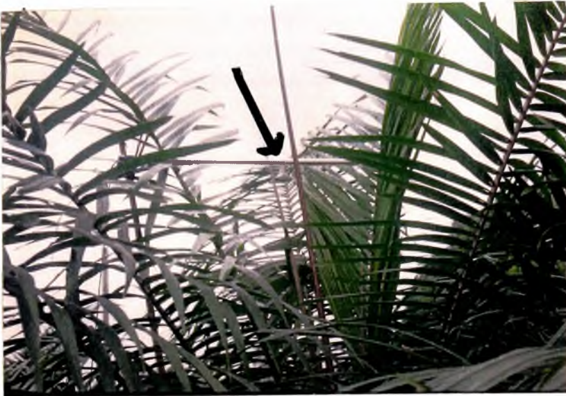
Plate 3.5 Tube Solarimeter installed above the Canopy of oil palm (arrowed)