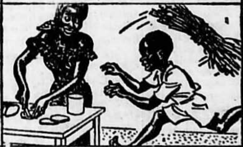
4 Johnny runs back to his mother, "I've brought you the wood. Now I want some more bread spread with Blue Band! It tastes so good and makes me feel big and strong!"