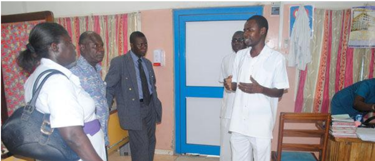
Figure 3.1: Health Workers in a discussion

This picture shows health workers in a discussion. It depicts health workers going about their usual duties. There is no way to tell by looking at the picture whether the HIV work place policy is being implemented.