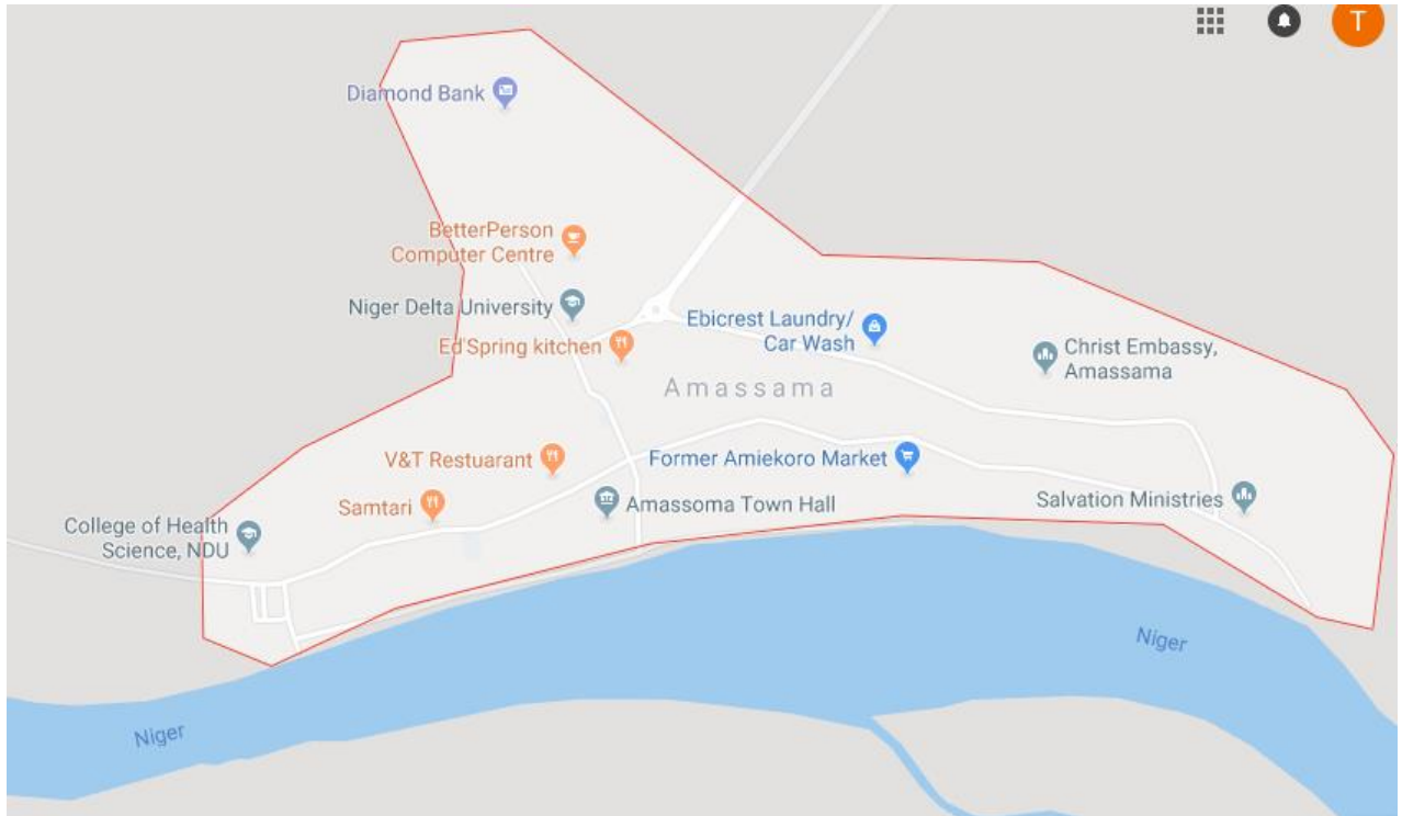
Figure 2: Map of Amassoma Community