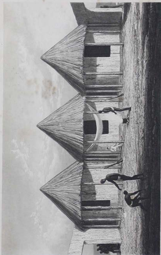
ACCOMMODATION AT THE COURT OF FUNDAB.