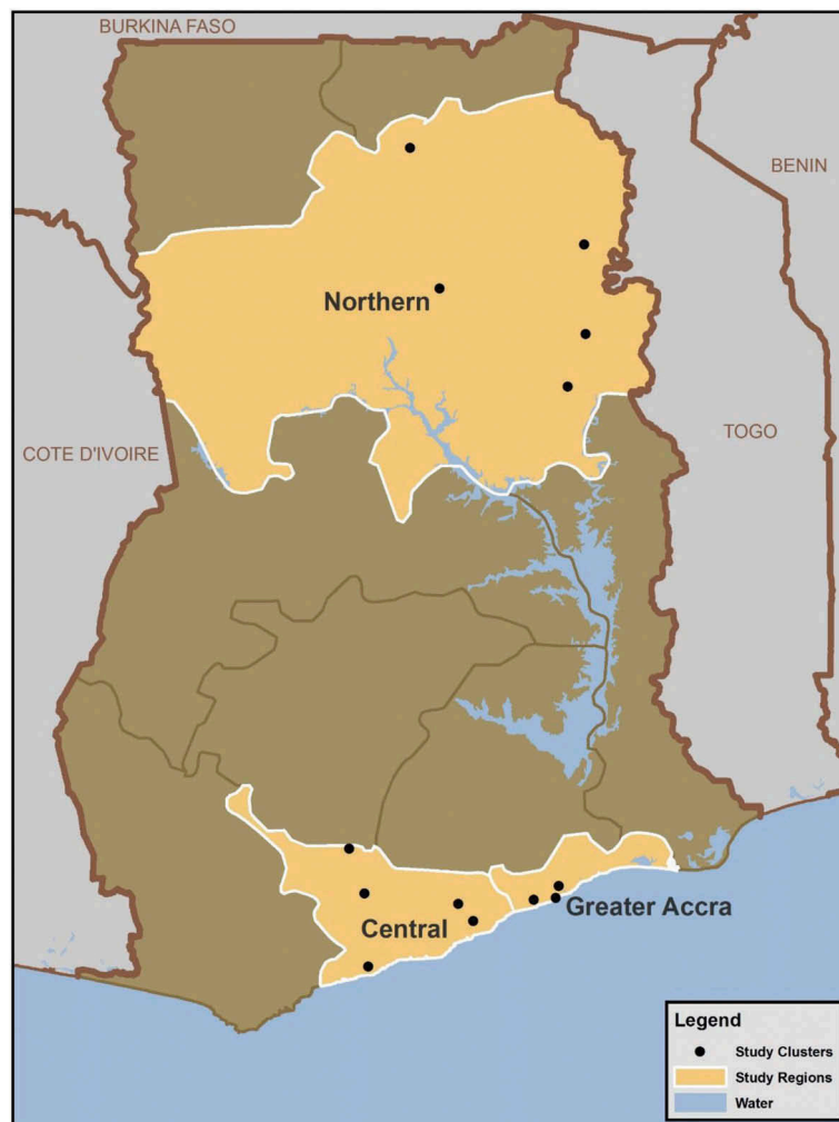
Figure 1. Survey clusters.

The follow-up study used three questionnaires, one for each of the eligible study groups: non-pregnant women classified by GDHS as having unmet need, pregnant women classified by GDHS as having unmet need, and a reference group of women currently using family planning. After an initial set of six identity verification questions, respondents were asked between one and three screening questions to confirm their eligibility for the assigned questionnaire (for example, 'Are you currently doing something or