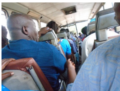
Figure 11: Inside of a Trotro

Closely related to the entrance of buses are the small aisle spaces which were mostly crowded and difficult to access (see figure 11). The seating arrangements are such that there is not enough room insides buses/trotros for persons with mobility disabilities.