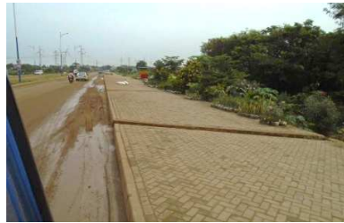
Figure 2: Inaccessible Sidewalk

This pavement is on the road from under the bridge in Ashaiman. As you can see, there are several gutters in it, making it difficult for me as a wheelchair user to use that road. I mostly use the major road regardless of the safety concerns. But when it rains, even the major road presents a much greater challenge and becomes unmemorable, crowded with sand. I remember when they were working on this road, I personally took it upon myself to talk to the contractors to ensure that the pavement would be accessible but they did not mind me. I feel worried that I could be knocked down by a car one day while using the road. This road is the major route from my house to the bus station. But because of this barrier, I do not go out a lot. (MD1, female, uses wheelchair).