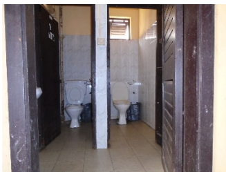
Figure 9: Toilet with narrow doors

users. So, anytime I have to attend to nature's call, I have no option than to park my wheelchair outside of the toilet rooms and crawl in and out. I have had to buy gloves for this purpose which I always use whenever I go to the toilet. This is to help prevent any infections. (SM4, male, uses wheelchair).