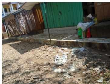
Figure 1: Rocky Pathway

Inaccessible Path/walkway. Walkways connect to main roads, but the pictures of walkways taken in this study were mostly muddy, rocky, hilly, and sandy; others had potholes which were waterlogged after rains. The nature of these walkways obstructed the movement of participants. While some participants, especially those using crutches, reported having fallen several times managing these barriers, others said they were hurt from the falls.