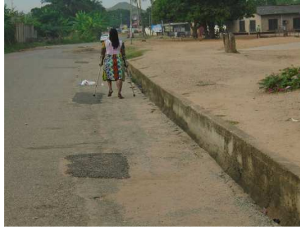
Figure 3: Uncovered Gutter