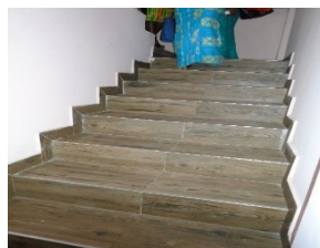
Figure 5: Staircase without handrail

It was identified that many public buildings were inaccessible. Storey buildings lacked or had no functioning elevators. In the absence of elevators, participants struggled to enter buildings. Those who used crutches held onto handrails of stairways to access the building. Imagine someone going to the third or fourth floor of a building on his/her crutches, which was the case in this study for those using crutches. Furthermore, the study identified that some of the stairways had no handrails, which posed another challenge for those who used crutches because it was extremely difficult and dangerous to climb those stairways (see figure 5).