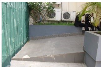
Figure 6: Obstructed ramp

The entrance to some buildings had steps. It is worthy to note that some organizations have attempted to put up access ramps for easy access to their buildings. However, the study revealed that majority of such ramps were either too steep or narrow, making them unusable. Other ramps were infested either with and/or ended with obstacles (see figure 6) and the related narrative beneath it. Both circumstances rendered the ramps inaccessible.