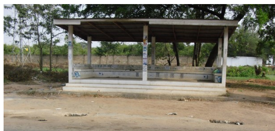
Figure 12: Inaccessible bus stop

Many bus stops, located in inconvenient places, were mostly not accessible to persons with mobility disabilities. The bus stops lacked curb cuts to enable persons with mobility disabilities to use sidewalks/stops to avoid the danger of being run over by buses or motor bicycle riders. In addition, some of the bus stops did not have shelters and those which had shelters were not accessible due to steps. This raises the question of what persons with mobility disabilities would do when it rains or when the sun is hot, given that they usually wait in transit for longer times. Also, drivers usually did not pay attention to where and how they parked for passengers to board their vehicles. Some parked at places not designated as parking spots. All of these impact on the safety of persons with mobility disabilities.