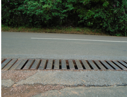
Figure 4: Split Metal Cover