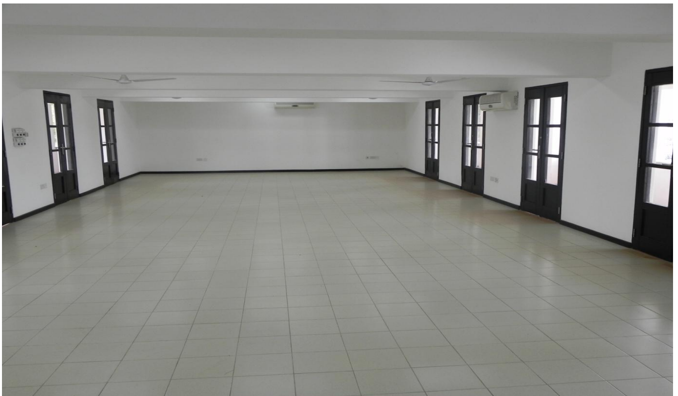
Figure 10 - Space provided in the Balme Library before construction works