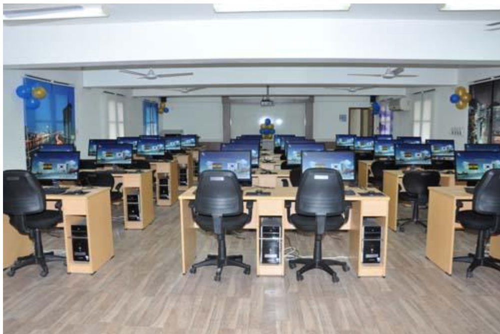
Figure 8 - IT Training Lab