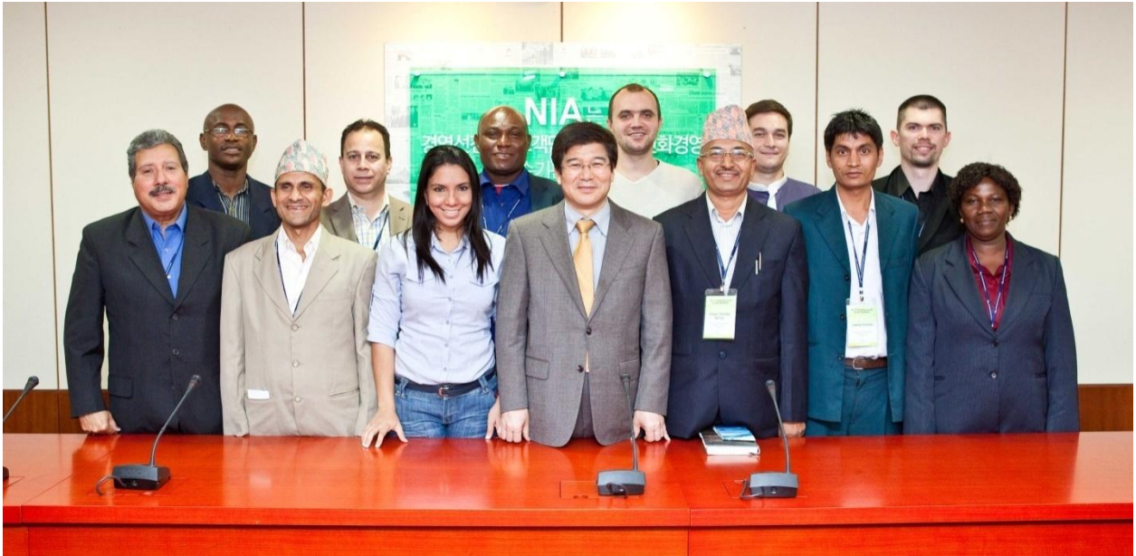
Figure 2- Participants of IAC 2011 Training in Seoul

Below is the progress report on construction (Phase I) of the Ghana-Korea Information Access center..