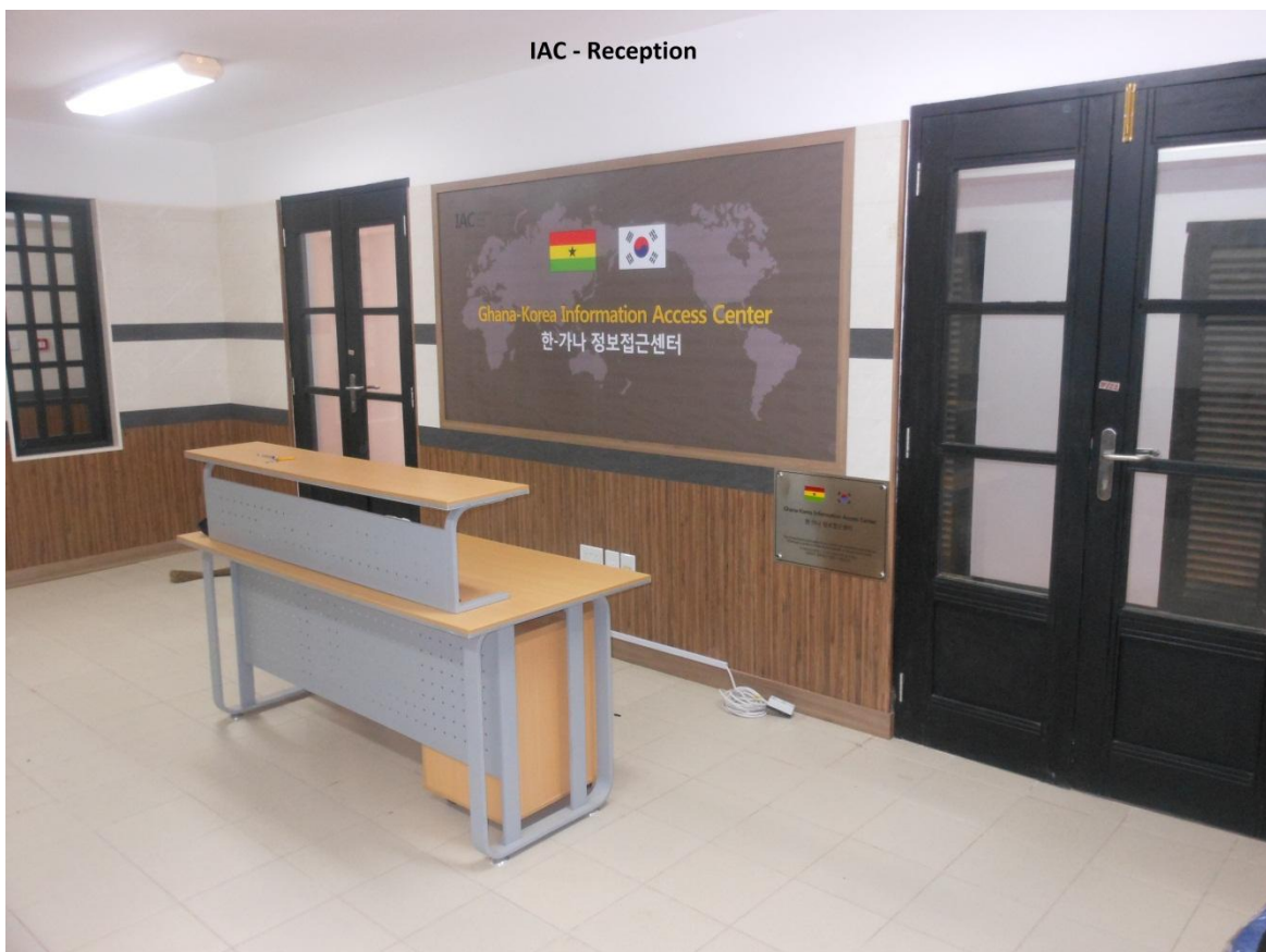
Figure 12 - IAC IT Training Lab. & Reception