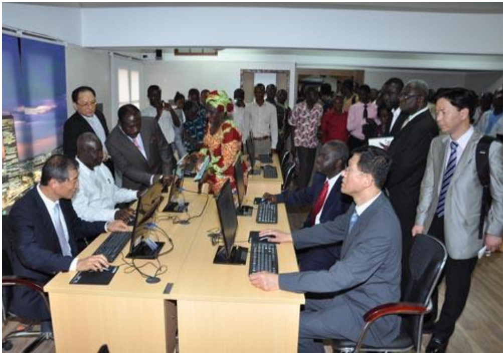
Figure 9 - Officials browsing the Internet at the Internet Lounge