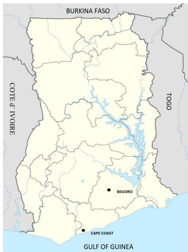
Figure 1 The map of Ghana showing the two study sites (black dot) within different ecological zones: Begoro in the forest area and Cape Coast in the coastal savanna area.

The antimalarial drugs used in this study included chloroquine (CQ), amodiaquine (AMD), artesunate (ART), mefloquine (MFQ) and dihydroartemisinin (DHA). These drugs were