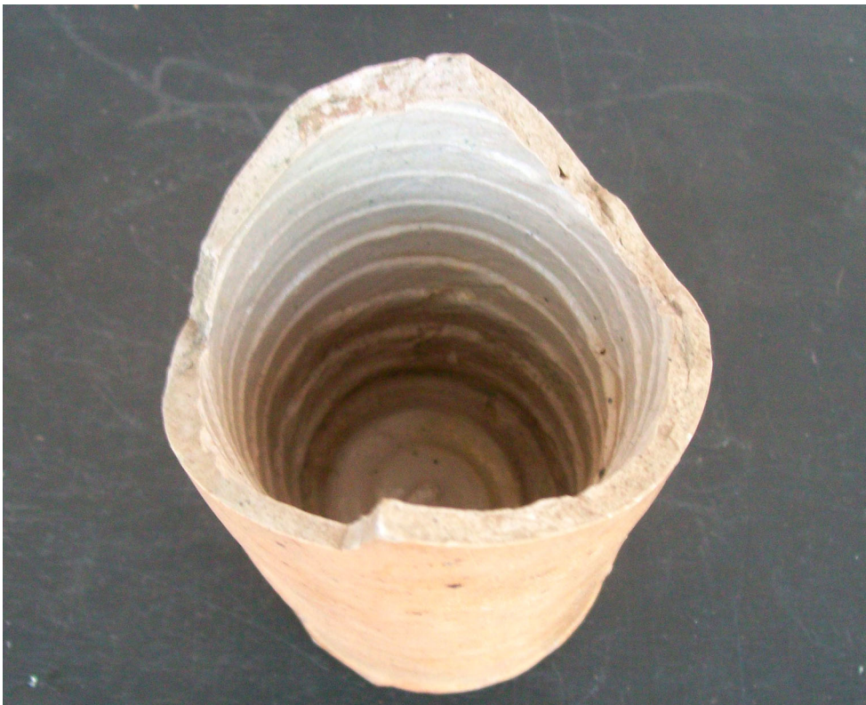
Figure 12. Ntwarkro: lower body of the Doulton water filter from Unit 5, Level 4, dating to c. 1880–1920.

A total of 52 heavily fragmented metal objects associated with European weaponry were recovered. They comprised two heavily worn gunflints, two fragments of shells, 42 cannons and part of a musket, all retrieved from Units 2 and 5. Gunflints retrieved