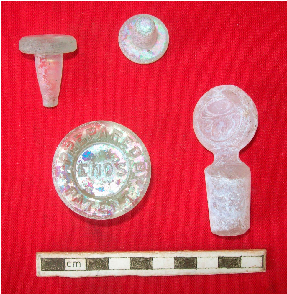
Figure 8. Ntwarekro: alcoholic and non-alcoholic beverage stoppers from Units 2 and 5 dating to c. 1750–1880.