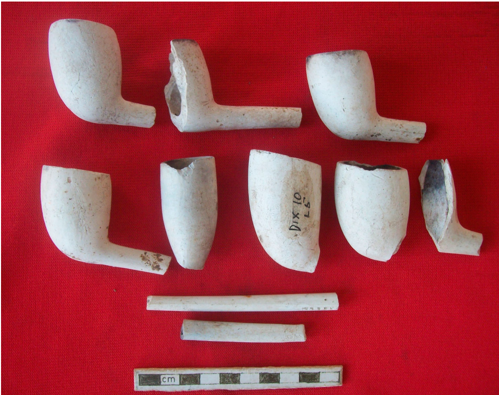
Figure 9. Ntwarkro: examples of excavated tobacco pipe bowls and stems dating to c. 1780–1900.