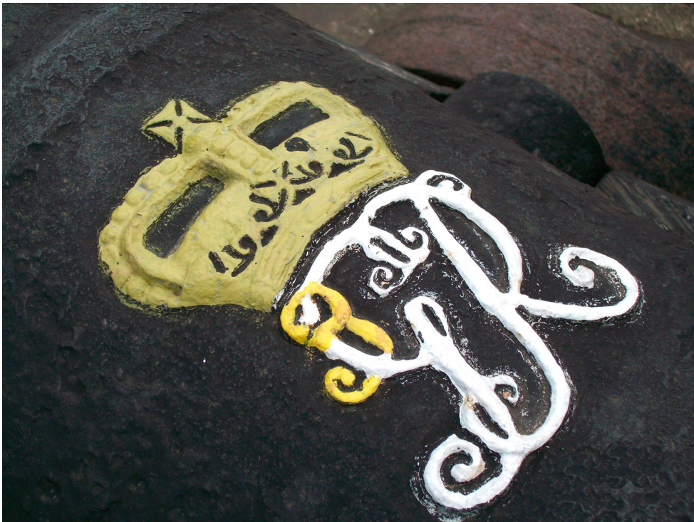
Figure 13. One of several unserviceable British-made cannons from Dixcove dating to c. 1780–1900.

A total of 154 artefacts associated with education and literacy were found, comprising 148 fragments of slate boards and six fragmented slate pencils (Figure 14). It is worth noting