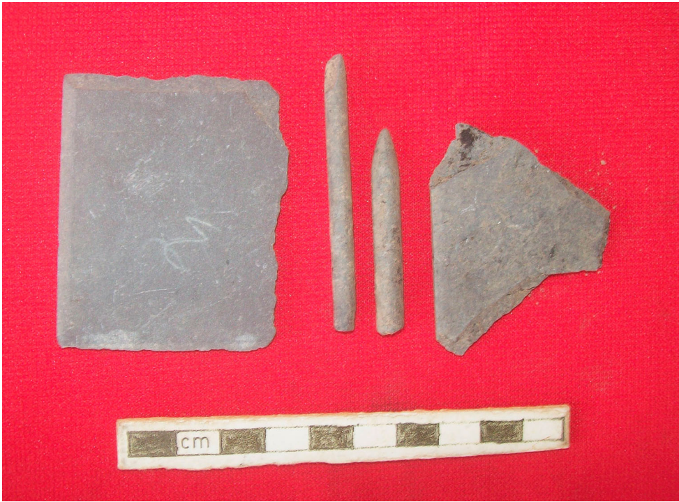
Figure 14. Ntwarkro: slate pencils and slate boards from Units 2, 3 and 4 dating to c. 1890–1950.

that 123 (79.9%) of these items were confined to the upper stratigraphic levels (Levels 1, 2, 3 and 4) of Units 2 and 5. Examination of the writing slates under a magnifying glass revealed a concentration of several irregular and jagged scratch marks/fine wear patterns concentrated along their inner central portions that indicated extensive usage. Their recovery near the fort suggests that writing and formalised instructional education may have been undertaken inside it. Some of the items found in association with these education-related materials included imported ceramics and plastic beads that can be dated to the mid-nineteenth to mid-twentieth centuries. Since the stratigraphy of Units 2 and 5 is undisturbed, these dates can be assigned to the educational materials under discussion.