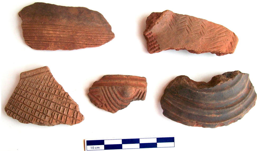
Figure 3. Ntwarkro: examples of the ceramics recovered showing the two principal decorative patterns present: short linear oblique/diagonal patterns (left) and short vertically inclined patterns (right).

A large faunal assemblage was also retrieved ( N = 14,029 ), the majority of it consisting of molluscs ( N = 11,463 ) rather than bone ( N = 2566 ). The identifiable fraction of the latter comprised 744 specimens (29.0%) with mainly long bones (femora, tibiae, fibulae, humeri) being the most common (61%) followed by metapodial and phalanges (32%) and teeth (7%). Mammals dominate the identifiable assemblage, followed by fish, reptiles and birds. Species present include domestic dwarf short-horn cattle ( Bos taurus ), sheep ( Ovis aries ) and goat ( Capra hircus ), along with giant rat ( Cricetomys gambianus ), cane rat ( Cricetomys gambianus ), grasscutter ( Thryonomys swinderianus ) and red river hog