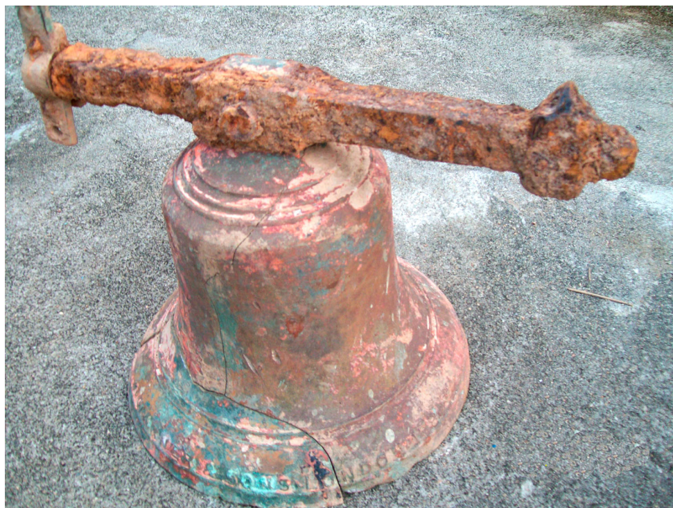
Figure 5. Ntwarkro: hanging metal bell from Unit 4 dating to c. 1720–1820.