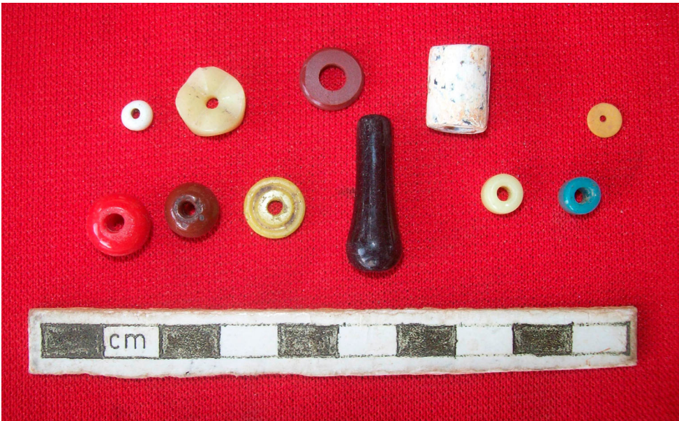
Figure 10. Examples of excavated Venetian polychrome (background) and monochrome (foreground) glass beads from the Dixcove study area dating to c. 1640–1820.