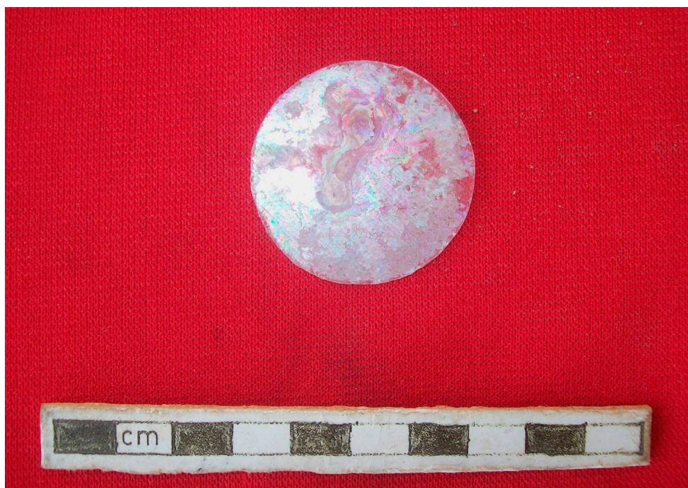
Figure 11. Ntwarkro: microscope dish with patina dating to c. 1880–1920.

Blakeman (2010: 226) has noted that before the nineteenth century medicines, particularly ointments, which had previously been packaged in galipots and small barrel-shaped pudding bowls and pots for export, were now placed within straight-sided transfer printed pots that rarely exceeded 5 cm in length and that had details of the manufacturer, retailer and the compounds embossed on their sides. In the latter half of the twentieth century,