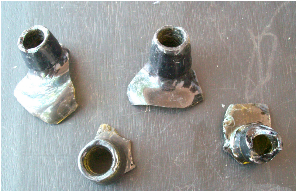
Figure 6. Ntwarkro: gin/schnapps bottle remains from Units 2 and 5 dating to c. 1780–1850.

Establishing the winery, distillery, chronology and country of origin of these beverages was difficult because of the very fragmentary sizes of the glassware found (mean area <10 cm 2 ). A sizable number had also developed patches of patina along several parts of their exterior and interior surfaces, further exacerbating the difficulty of identifying them. Only 11 fragments were lettered with identifiable trademarks and seals. The majority originated from distilleries in Britain and The Netherlands. Other recovered non-alcoholic glass bottled items of indulgence included pomade containers, toilet water bottles, 'torpedo'-shaped soda water bottles, scented oil bottles, pickle jars and syrup bottles. Other notable items included Perrier mineral water bottles, fragments of panes of mirrors that