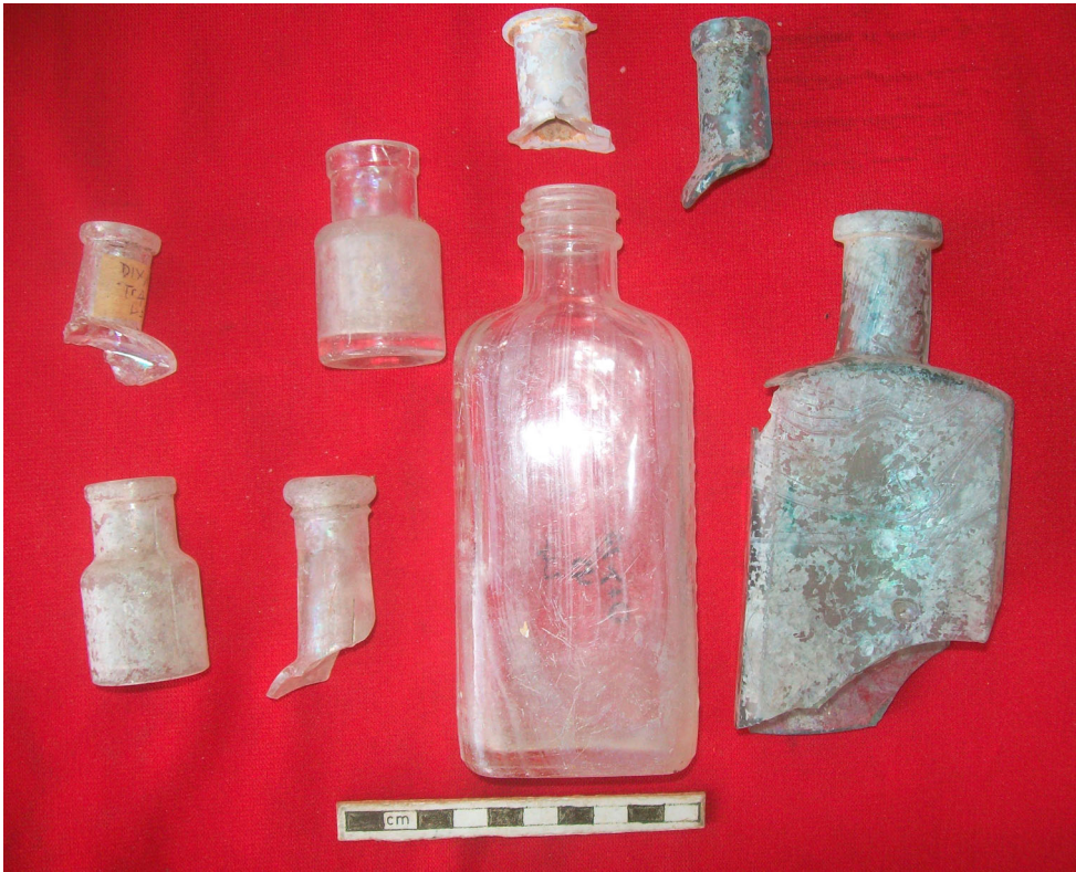
Figure 7. Ntwarkro: excavated fragments of soda water and pomade-holding bottles from Units 2, 4 and 5.

had lost their reflective mercury coating and lavender and perfume bottles. Perfume bottles were the most common non-alcoholic glass container present ( N = 107 , 35.0%). Further information on the items with identifiable marks is provided in Table 8 .