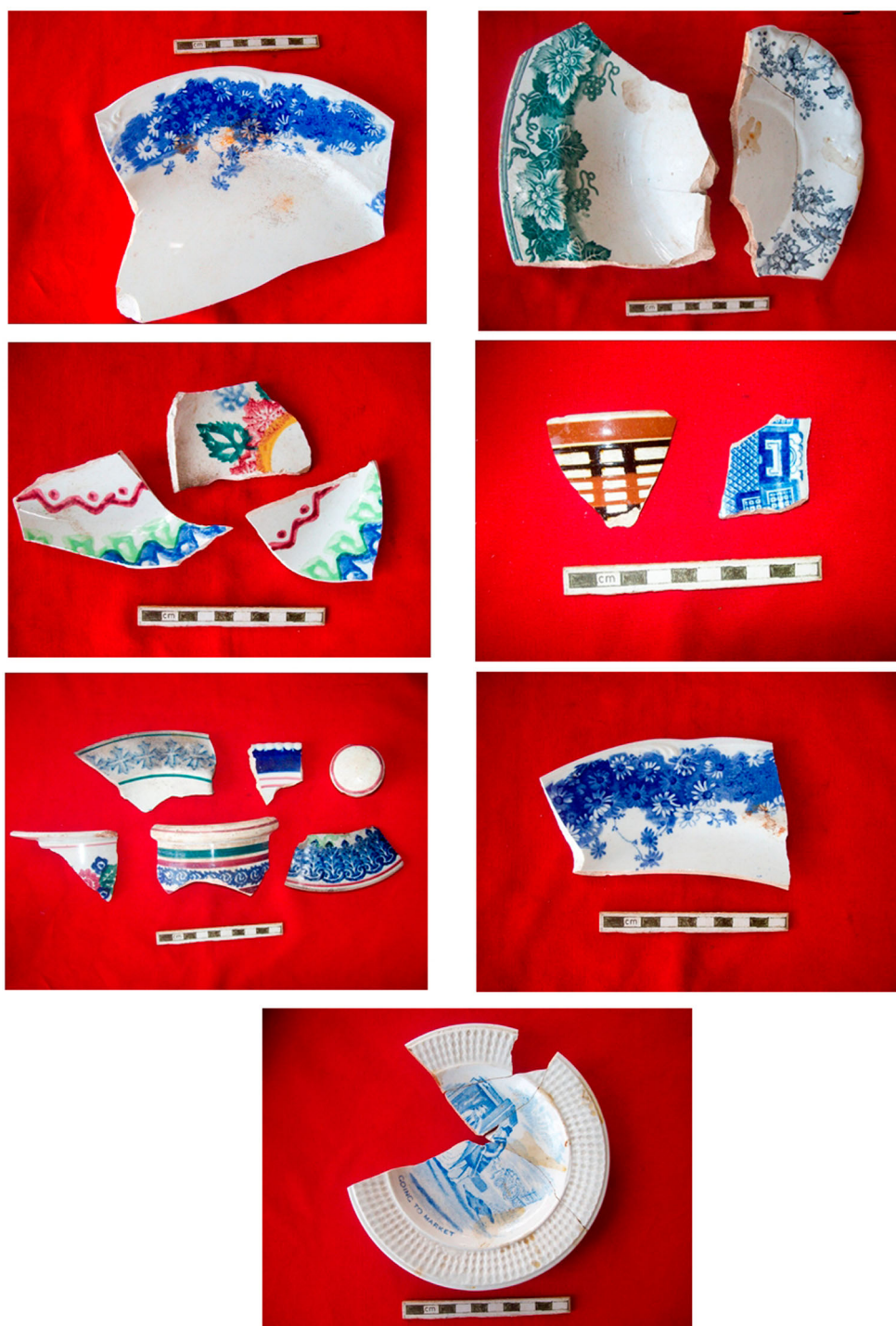
Figure 4. Assorted imported creamwares, whitewares and porcelains from the Dixcove study area dating to c. 1740–1880.