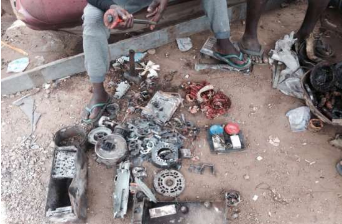
Plate 4.1: A section of dismantled metal scraps at Ashaiman scrap yard

fractions, sell their components to middle-men, auto repair shops as well as artisans who use local technology to manufacture cooking pot, coal pot etc.