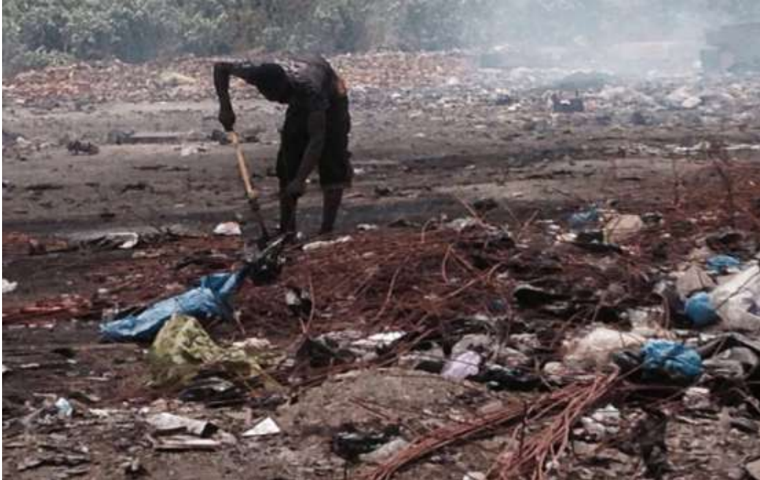
Plate 4.5: Example of a scrap picker recovering metals after open burning method

Evidence gathered shows that after the scrap dealers purchase the scrap metals; they either dismantle them by themselves or contracted others to dismantle it for a fee, depending on the quantity of the scrap metal. Dismantling is done in order to retrieve precious fractions (copper, aluminium, steel etc.) from faulty engine blocks, wire, machineries etc. Often operational tools (hammer, chisel, spanners etc.) and gas torch or electrode are used to dismantle and cut large sizes into smaller pieces for easy loading and off-loading into trucks. Another important observation was that the main activity done by the scrap metal workers was to extract valuable fractions from cable wires through open burning (see Plate 4.5).