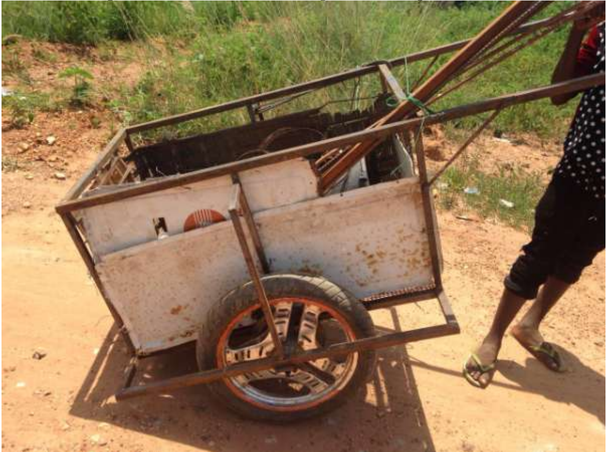
Plate 4.6: Example of a hand cart used for scrap metals transportation

complained of body pains during long hours of walk in search of metals coupled with pushing of hand carts, carrying of sacks and loading and off-loading of heavy metals on their hand cart (Plate 4.6).