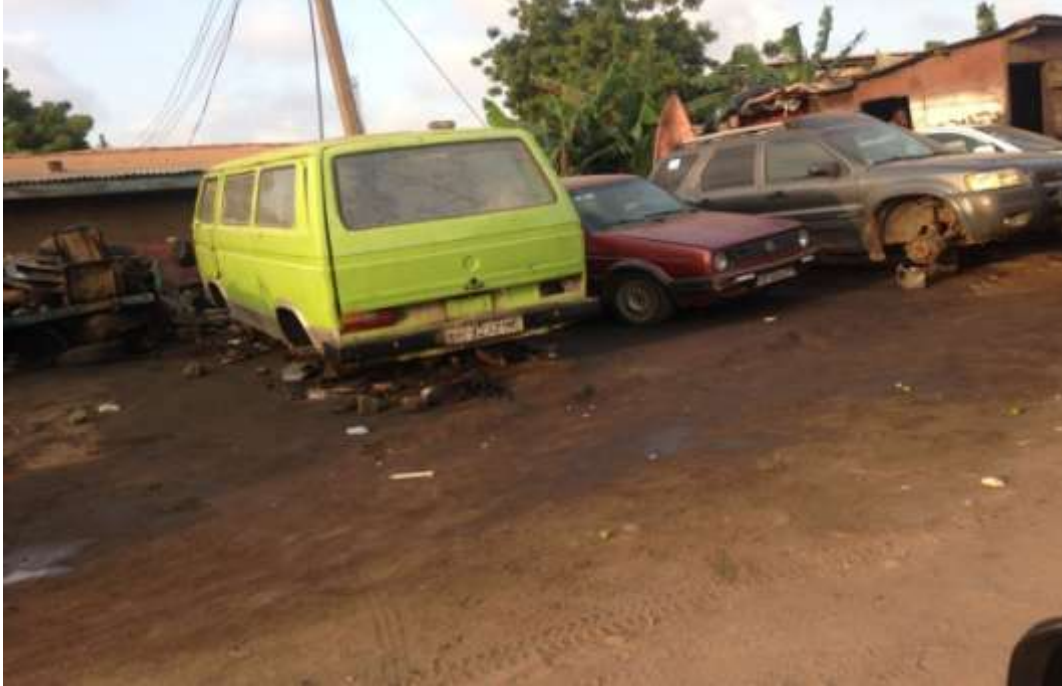
Plate 4.4: A section of broken vehicles acquired by scrap dealers at Tema

automobiles which are beyond repairs to scrap workers and make extra cash as well as help clean the environment”[A 19years, mechanic apprentice].