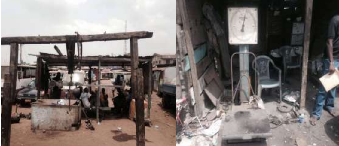
Plate 4.3: Examples of weighing scales used in scrap trading activities at Ashaiman