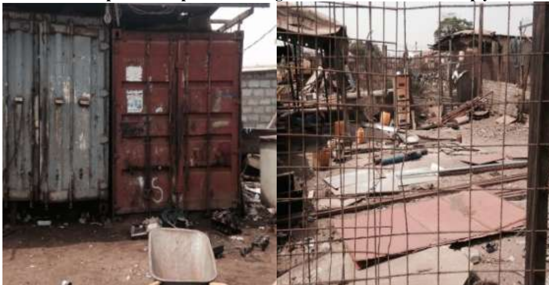
Plate 4.2: Examples of scrap metals storage facilities at Ashaiman scrap yard

The middlemen serve as intermediaries between scrap pickers, dismantlers. Only one middleman was interviewed. Indeed, it was difficult getting the middlemen due to the nature of their work because they are not always present at the yard. The middlemen build bulk and eventually sell to the scrap dealers who also sell to the downstream processors in Tema. An observation that was made during the fieldwork was that in the middleman’s shed it was common to find a weighing scale which is most at times adjusted by the middleman to their advantage. After weighing the scraps metals cash exchange hands quickly and goods enter the stocks (metal containers /protected yard were scrap metal are kept) (Plate 4.2).