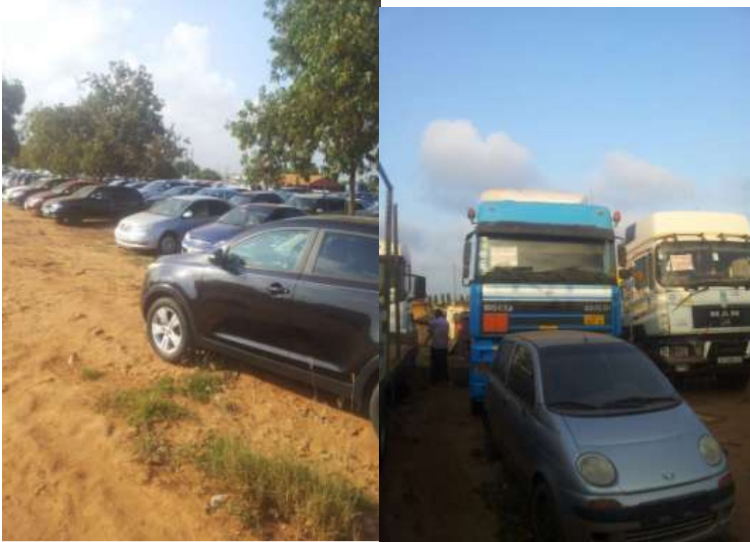
Plate 3.1: A section of second hand vehicles on display for sale at Tema