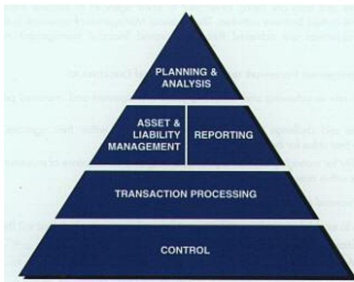
Figure 2.2: Hierarchical Framework of Financial Management

Internal Audit has evolved from a primarily financial compliance function to a key component of an organization's governance framework. Internal auditing plays a vital role in the financial management of any organization. This is because in every framework of financial management (Planning and Analysis, Asset and Liability Management, Transaction Processing and Control) Internal Audit seems to have an interest in it. Figure 2.1 below is the hierarchical framework of Financial Management as per the Financial Management Framework (FMF) developed in the United States in 1987.