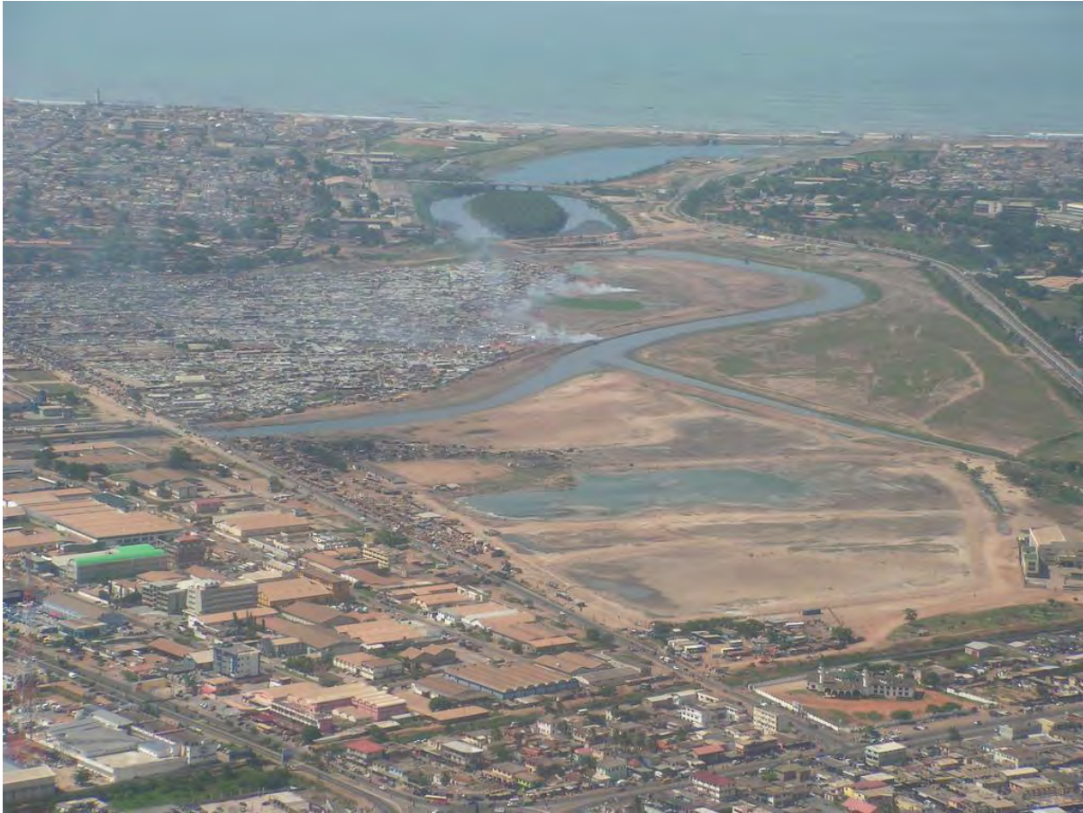
Figure 2.1: Ariel view of Agboghloshie, Accra, Ghana.