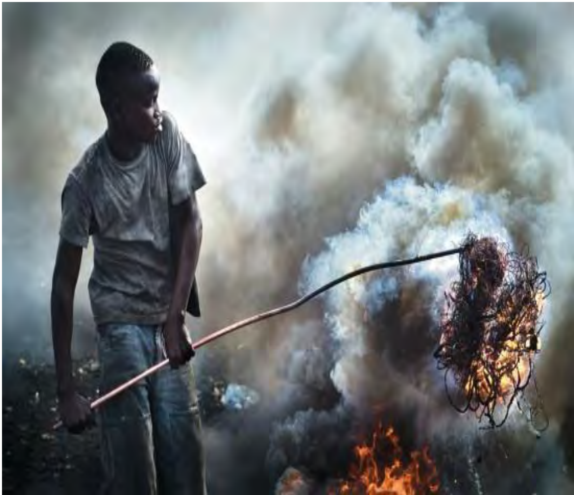
Figure 3.1 Toxic fumes from e- waste burning