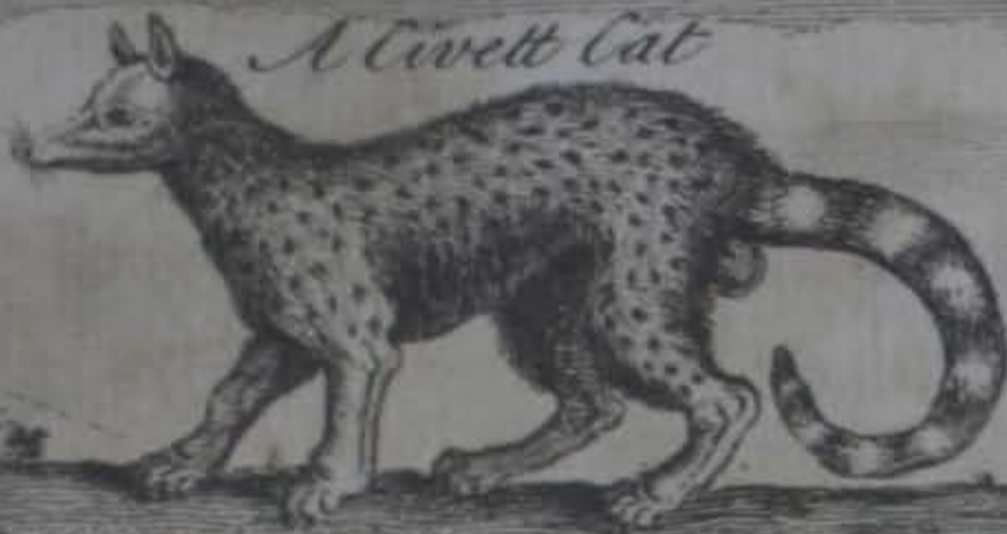
A Civett Cat