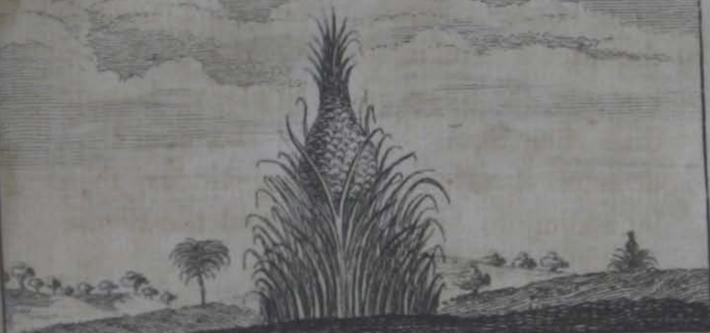
A Pine Apple