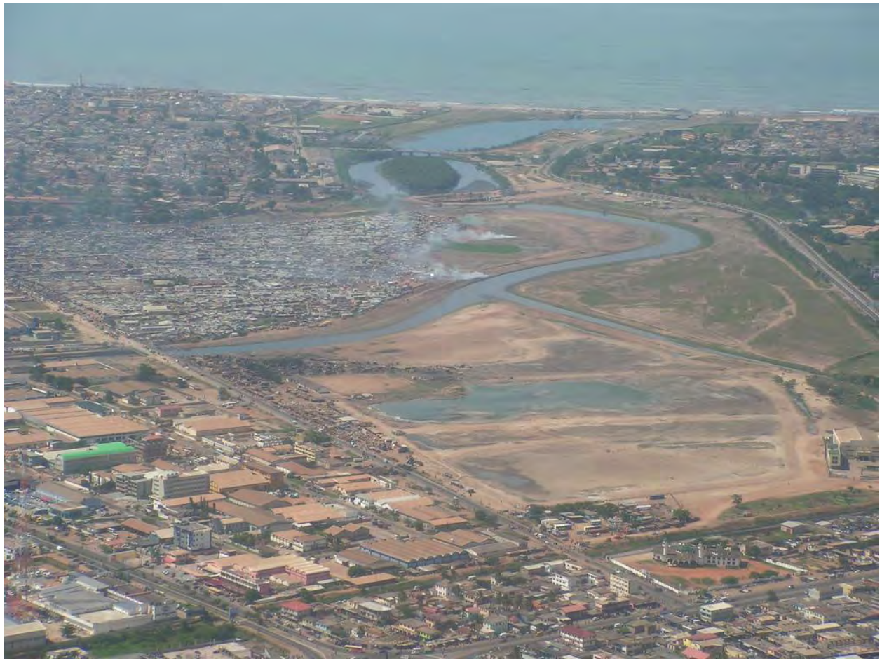
Figure 2: An aerial photograph showing Agbogbloshie scrap yard where e-waste recycling including open air burning takes place, Accra.