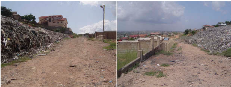
Figure 2. Close proximity between landfills and residential development. 5

operators also eventually ceased their operations, mainly due to the takeover of the quarry sites for residential developments. These were primarily single and two-story houses—targeted at Ghana’s growing urban middle and upper-classes (see Grant, 2009; ISSER, 2013). It is these quarry pits that have been used and continue to function as landfills for waste disposal in Accra. However, the presence of residential houses that predate landfill operations has resulted in very close proximity between the landfills and residential development. In fact, some houses could literally be described as “sitting” on the landfills, as illustrated in Figure 2.