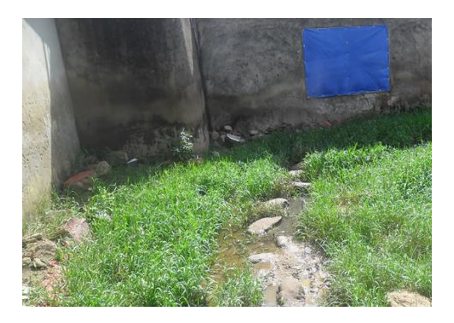
Fig. 2 Houses built on flood prone land

poverty, corruption and bureaucracy as important barriers. A tour around some of these areas revealed some houses sitting on pools of water (Fig. 2), buildings that were possibly approved without knowledge of the nature of the land or soil. Community members also indicated the presence of mosquitoes throughout the year because water from the bathrooms and domestic chores sits behind the houses and becomes a breeding ground. These areas are increasingly being used, putting human lives and property at risk as climatic hazards are expected to increase.