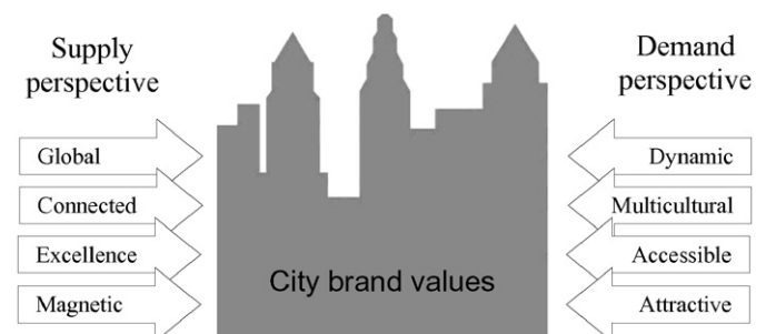
Fig. 2. Brand values associated with Leeds.

However, a closer look reveals that the points of agreement operate on different levels. The supply side was more abstract and strategic, and the demand side was more tangible and functional. For instance, brand administrators focused on the notion of "the best UK city" as a future vision, while the demand side emphasized functional improvements in the physical facilities to enhance experiences (Wong & Yu, 2003). This finding corroborates extant knowledge that brand perceptions operate on different levels across stakeholder groups (e.g., Merrilees et al.,